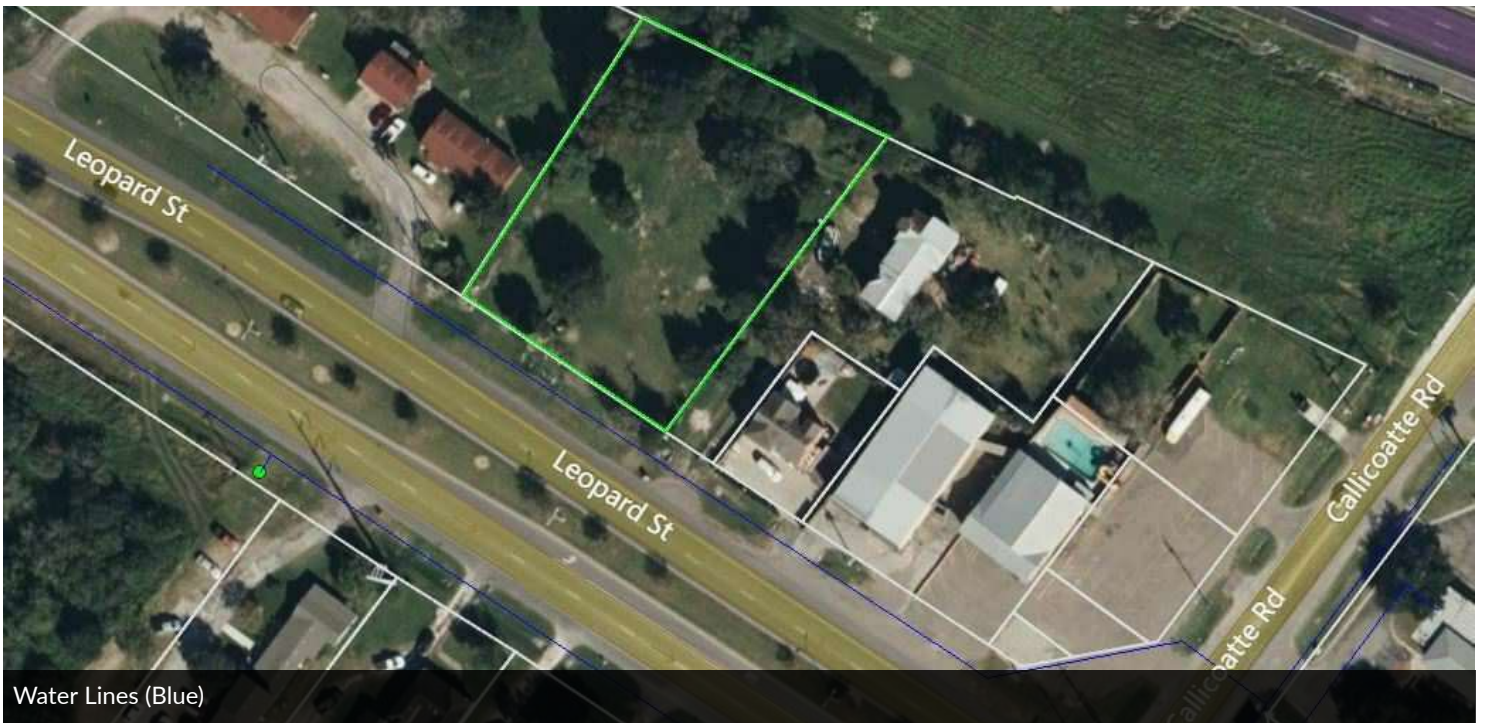
Water Lines (Blue)

DAVID HEITZMAN 361.541.4417 dheitzman@craveyrealestate.com