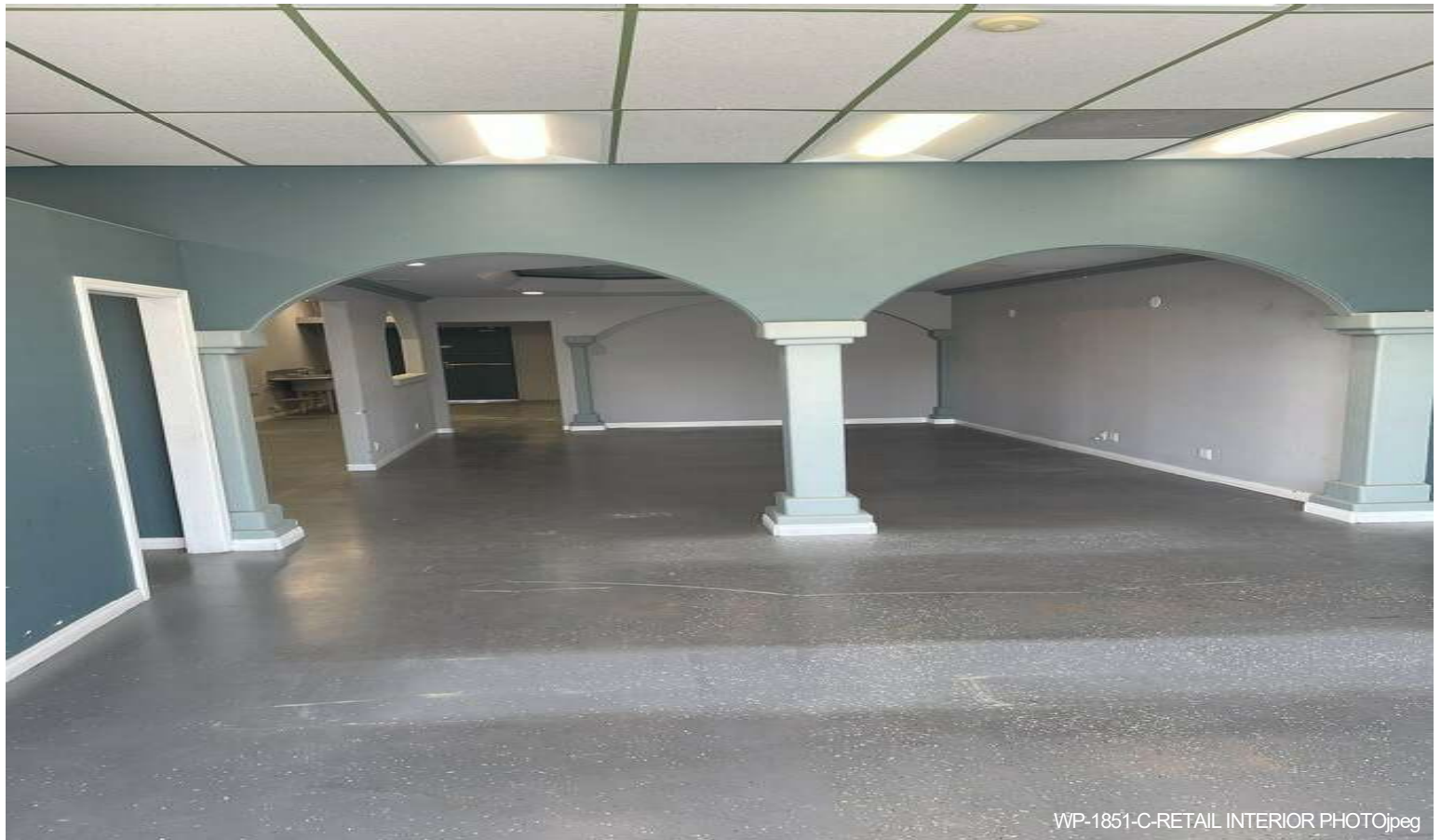
WP-1851-C-RETAIL INTERIOR PHOTO.jpg