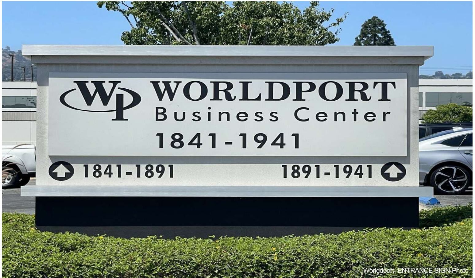
Worldport- ENTRANCE SIGN-Photo