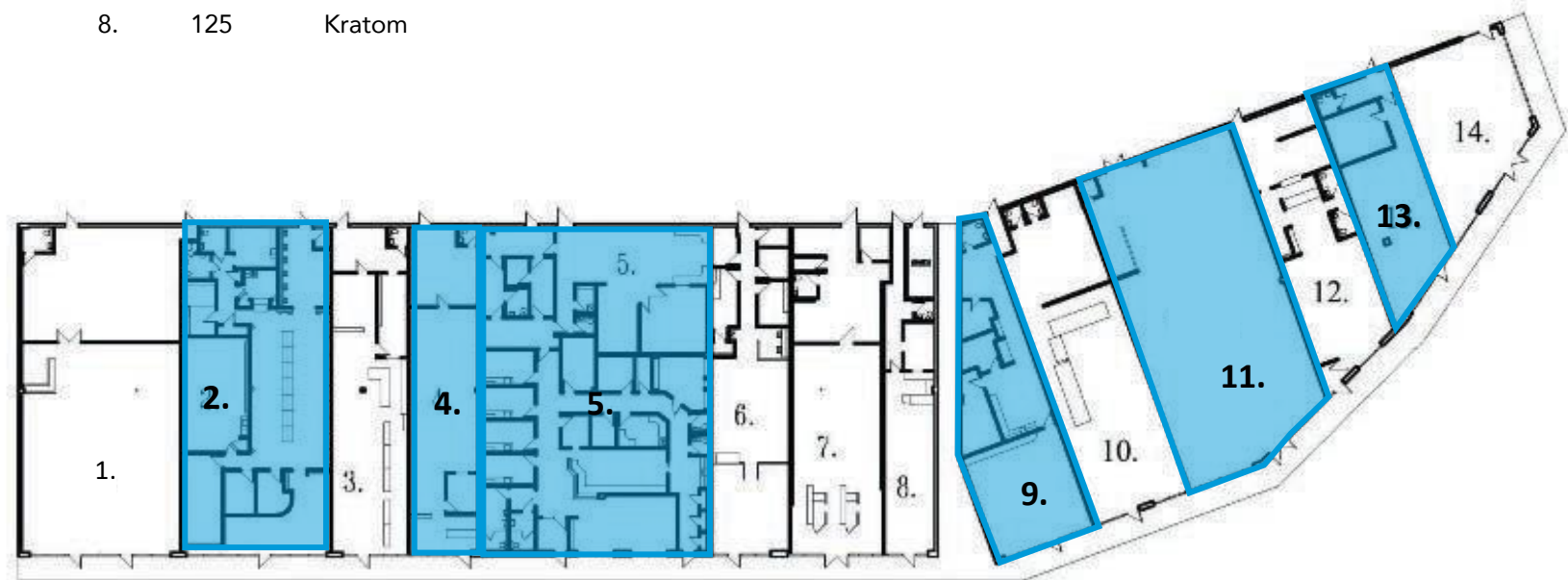
FLOOR PLAN NOT TO SCALE