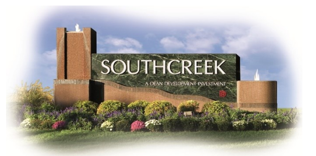
Building V—12980 Metcalf