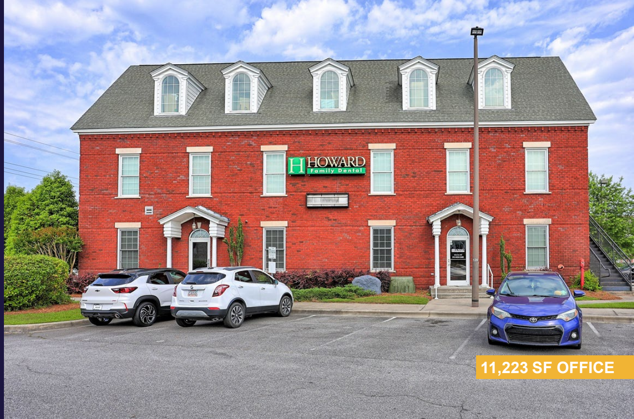
11,223 SF OFFICE