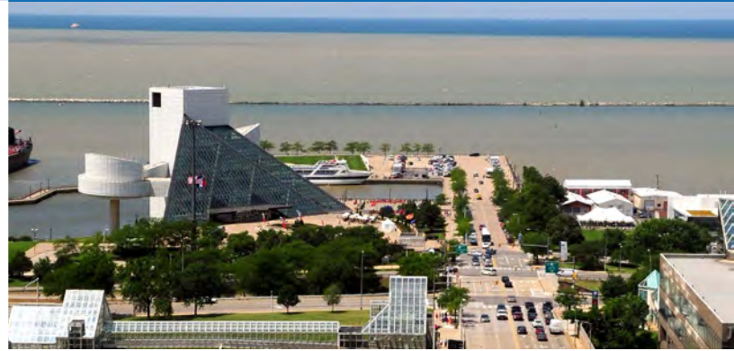
Excellent Views of Downtown Cleveland and Lake Erie