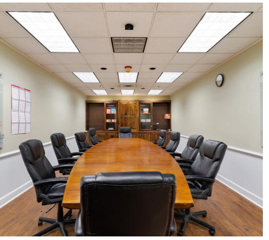
*All SF's are approximate