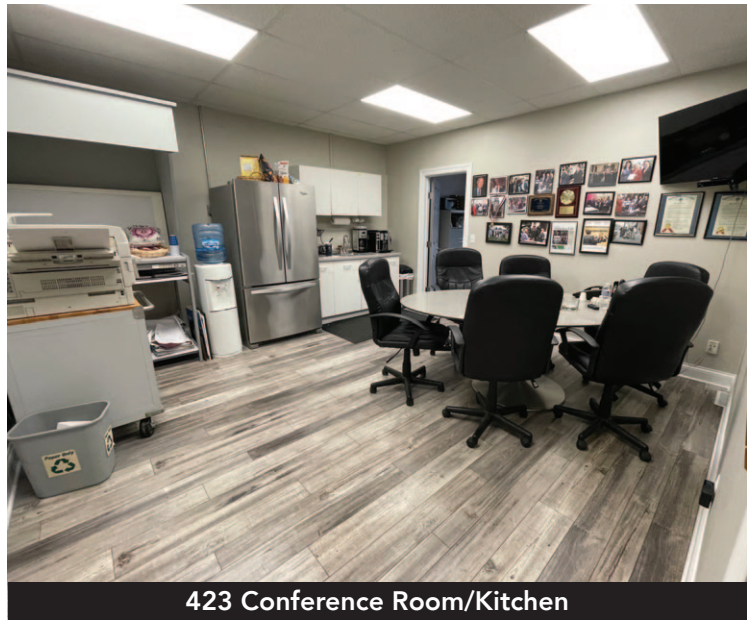
423 Conference Room/Kitchen