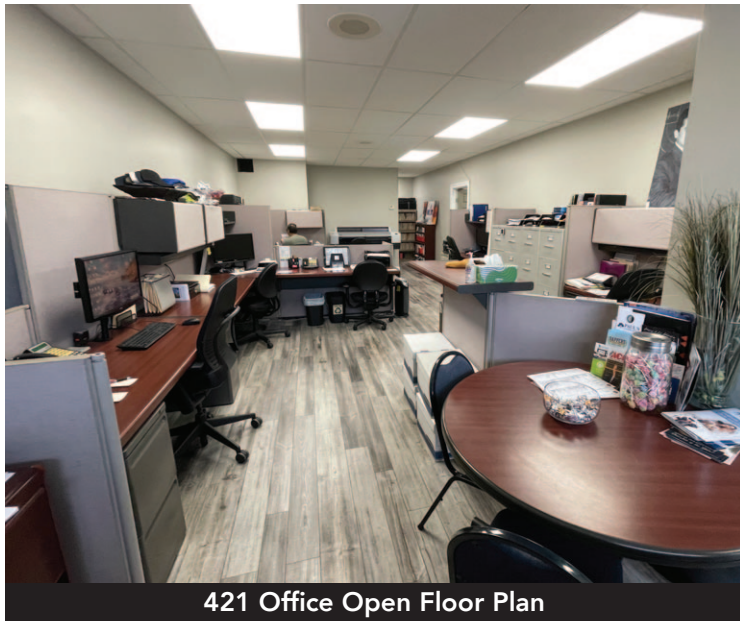
421 Office Open Floor Plan