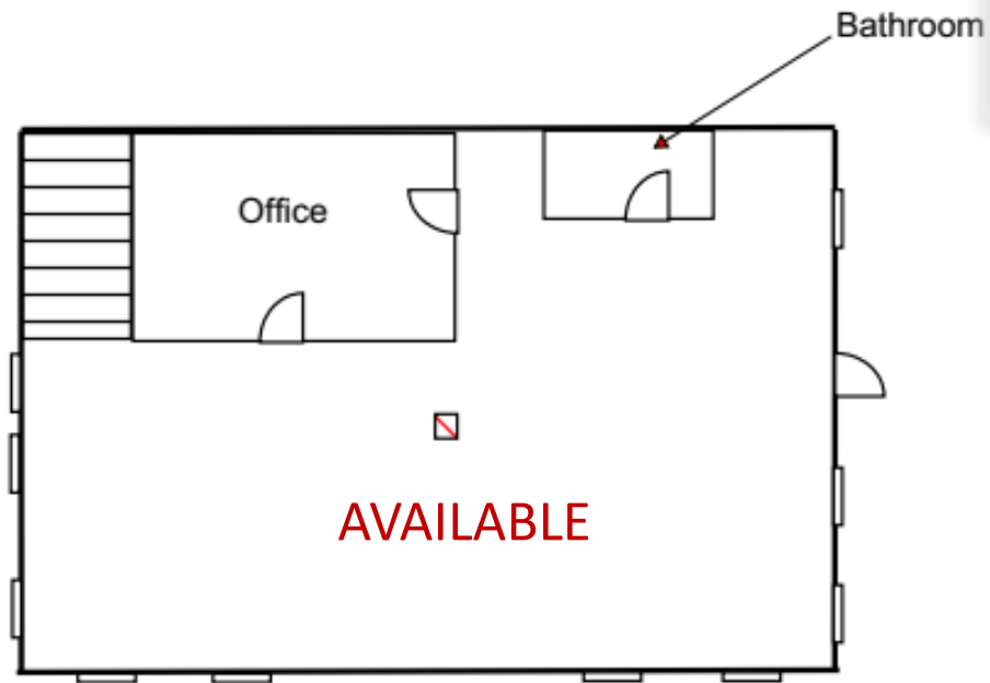
2nd Floor Office Approx 2500 sq.ft.