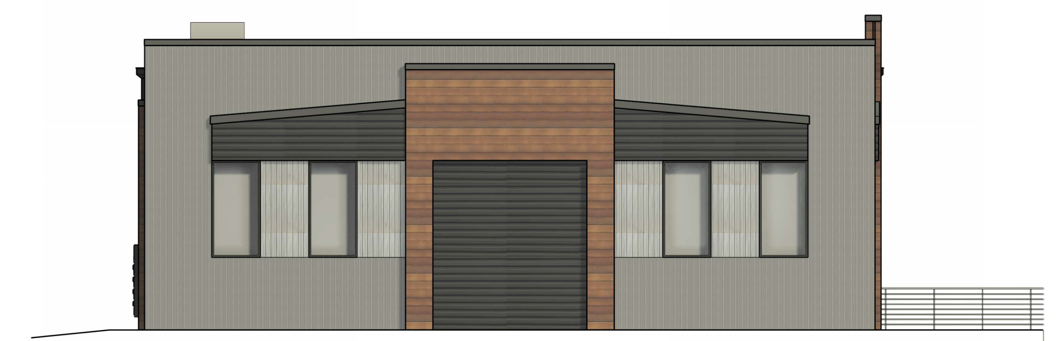
3 WEST ELEVATION - MARKETING MA2 1/8" = 1'-0"