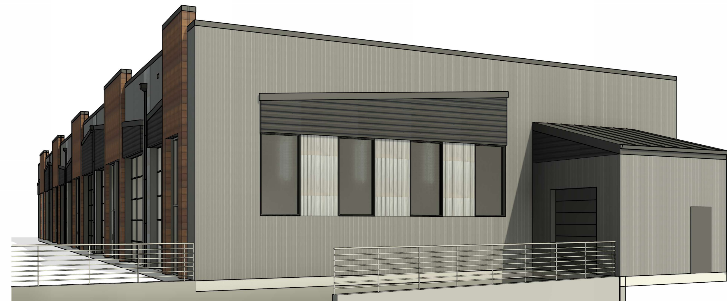
3 3D VIEW - SIDE 2 MA3