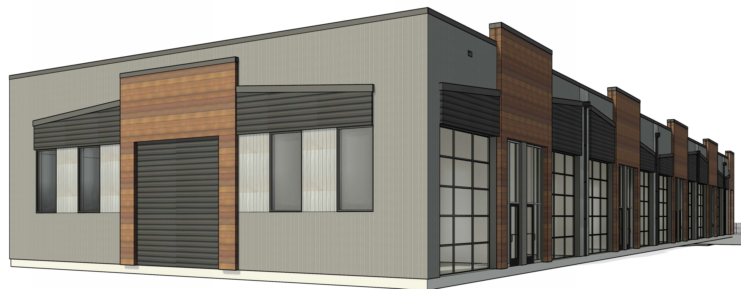
2 3D VIEW - SIDE 1 MA3