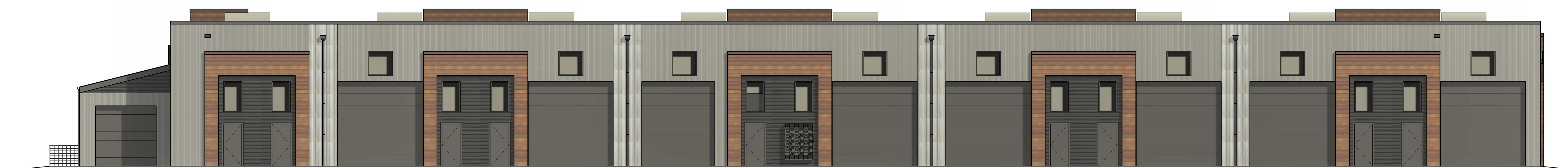
4 NORTH ELEVATION - MARKETING MA2 1/8" = 1'-0"