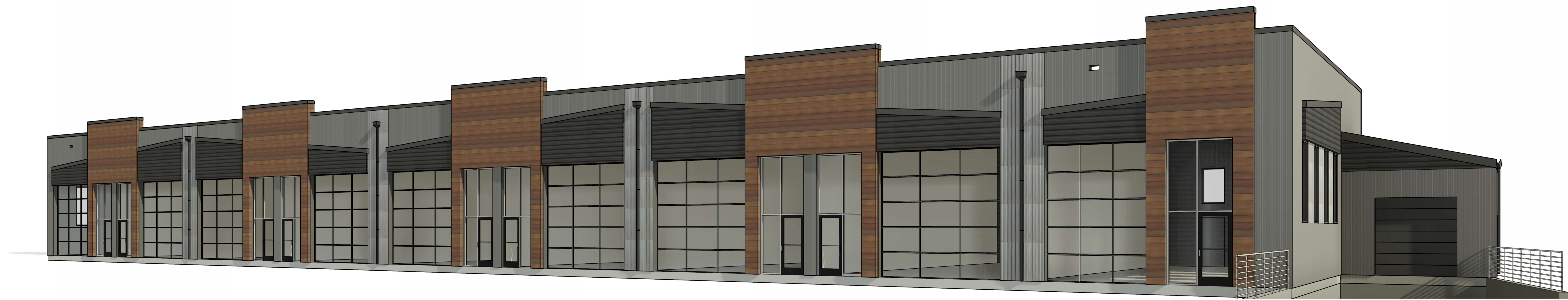
1 3D VIEW - FRONT MA3