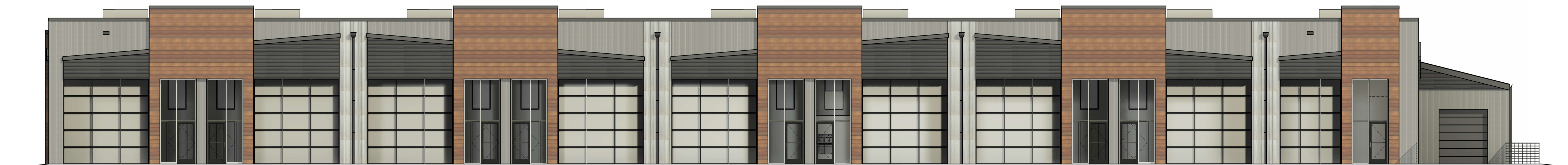
1 SOUTH ELEVATION - MARKETING MA2 1/8" = 1'-0"