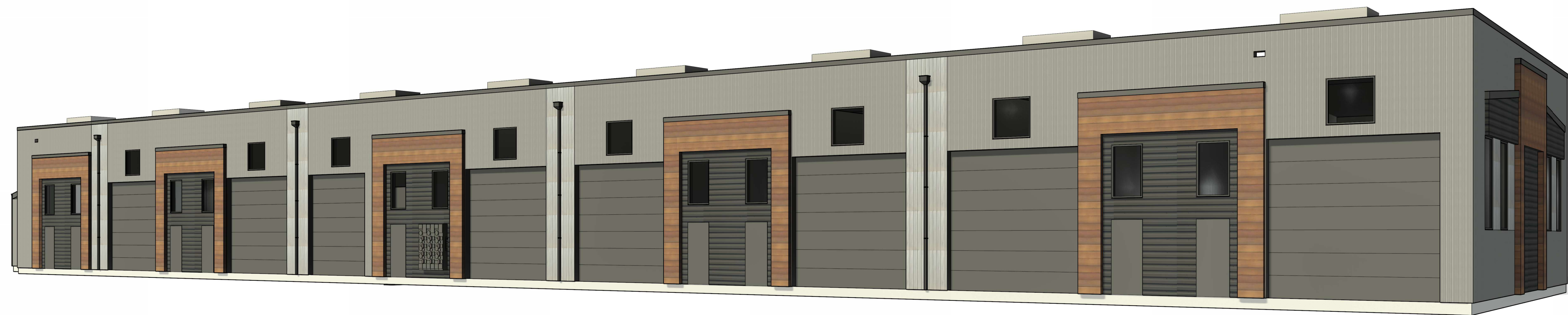
4 3D VIEW - REAR MA3