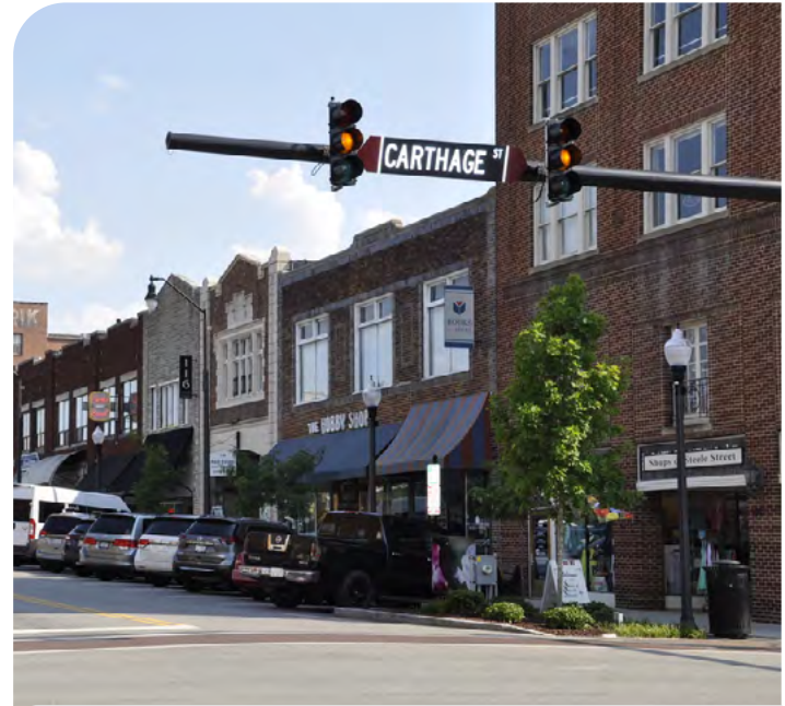
VIEW ALONG S STEELE STREET