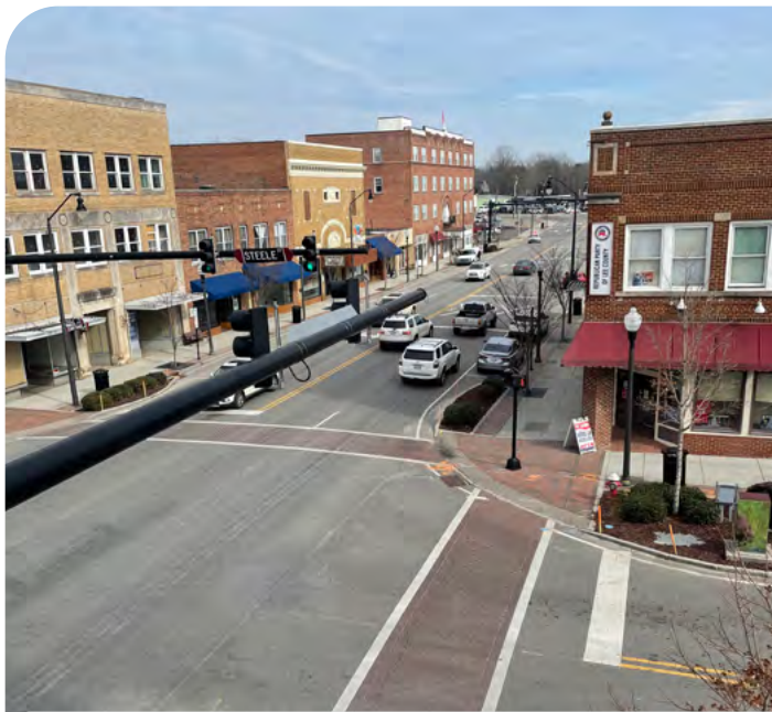
VIEW FROM 2ND FLOOR