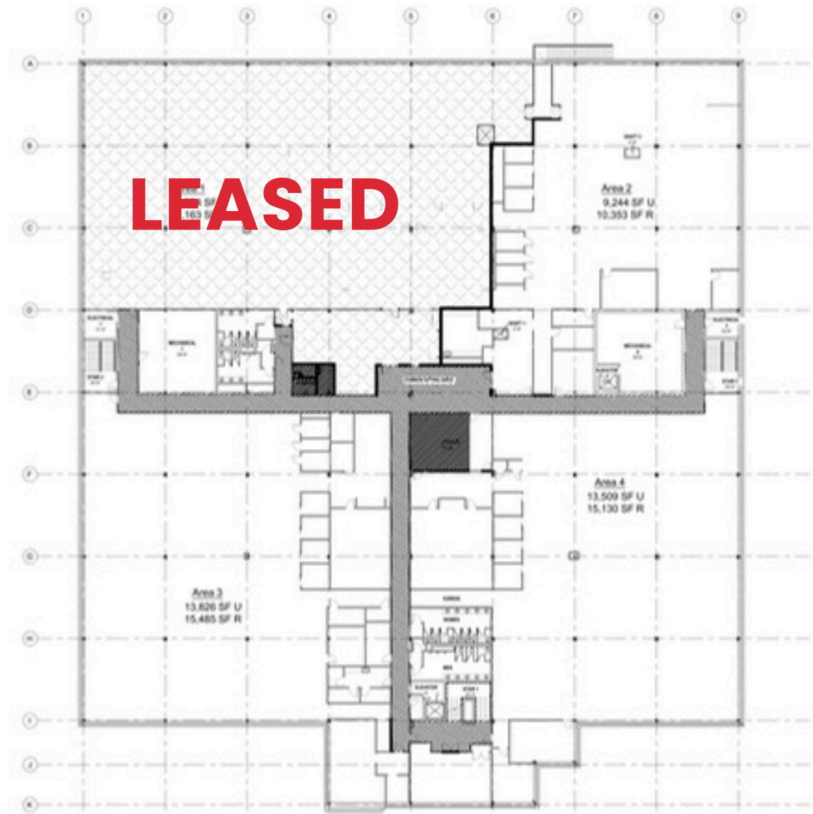
OVERALL SECOND FLOOR 1/32" = 1'-0" 14 CENTRAL PARK, HOOKSETT, NH 01-13-2025 PROCON, LLC