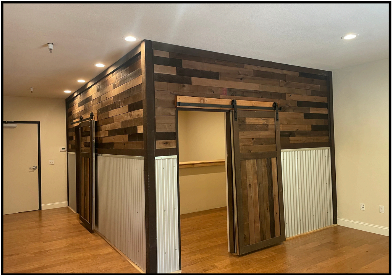
Interior Private Office