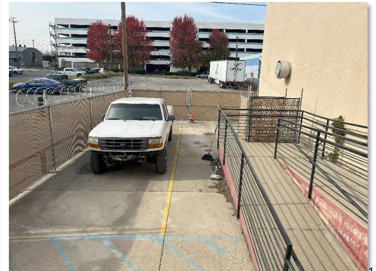
SDS REALTY INC 108 N WASHINGTON #600, SPOKANE WA. 99201

This information has been secured from sources we believe to be reliable, but we make no representations or warranties, express or implied, as to the accuracy of the information. References to square footage or age are approximate. Buyer/tenant must verify the information and bears all risks for any inaccuracies.