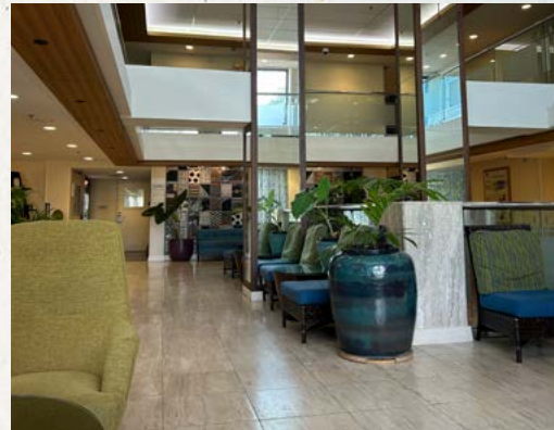
DoubleTree by Hilton Alana, Lobby