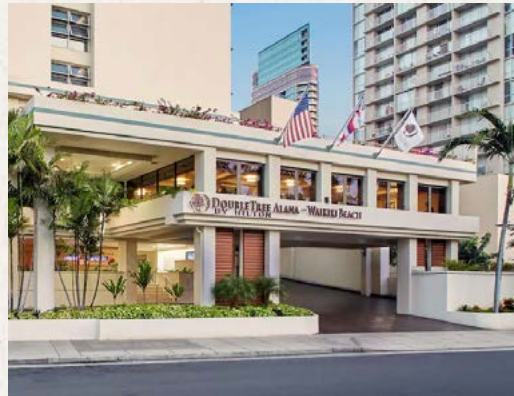
DoubleTree by Hilton Alana