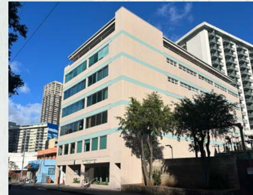
Alana Waikiki Business Center