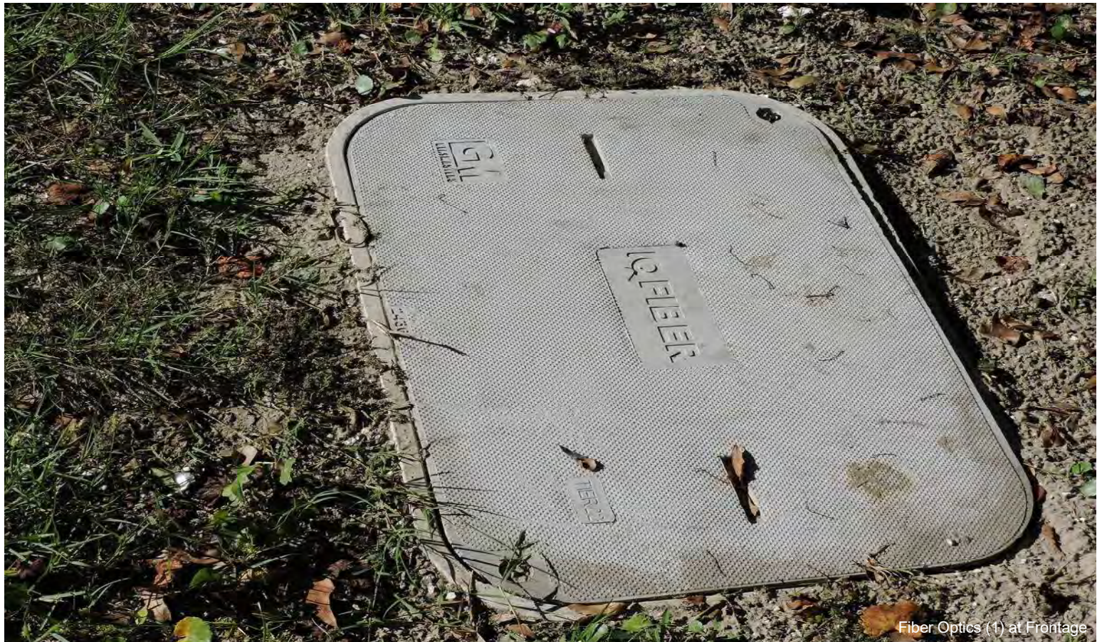
Fiber Optics (1) at Frontage