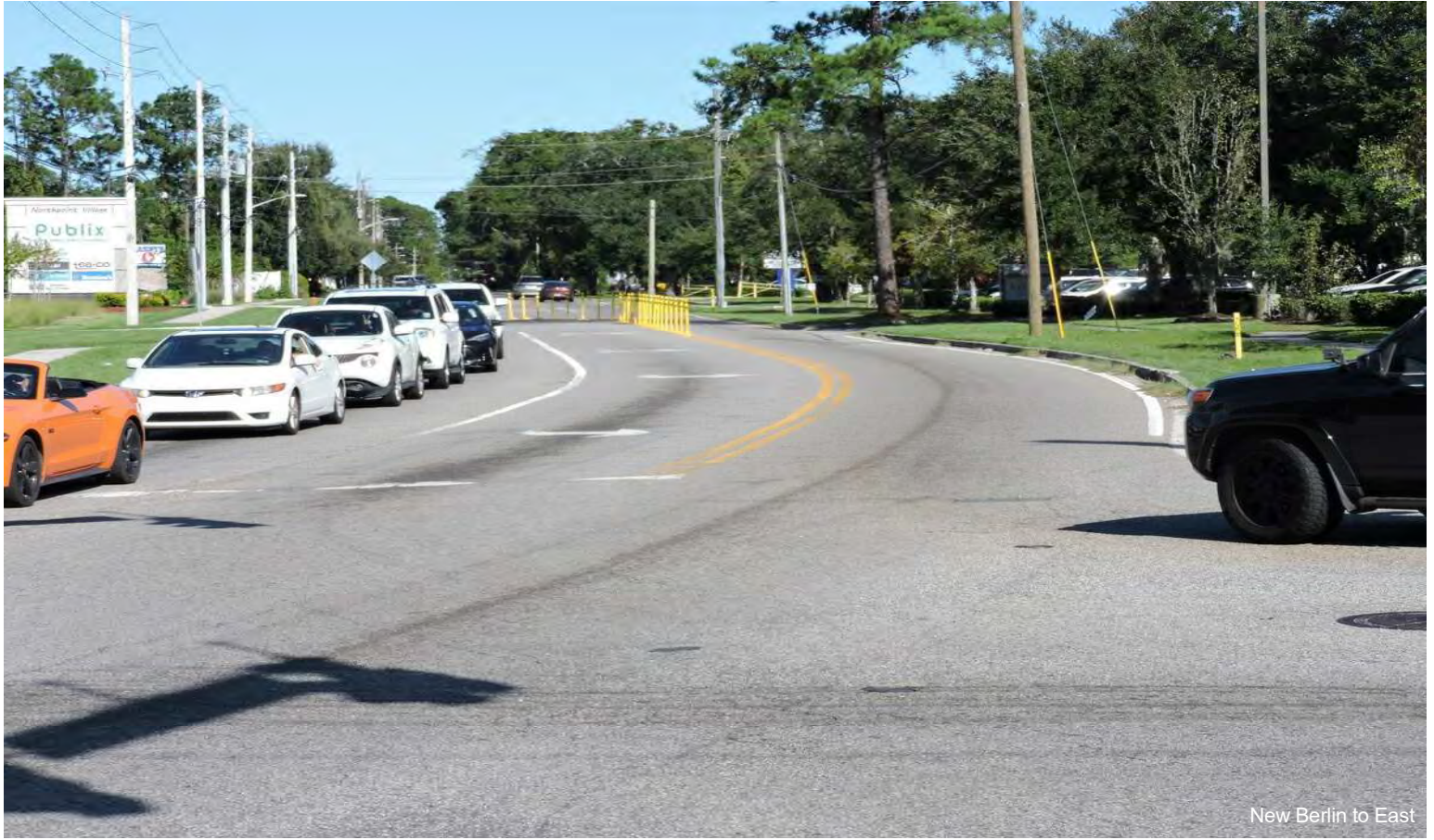
New Berlin to East