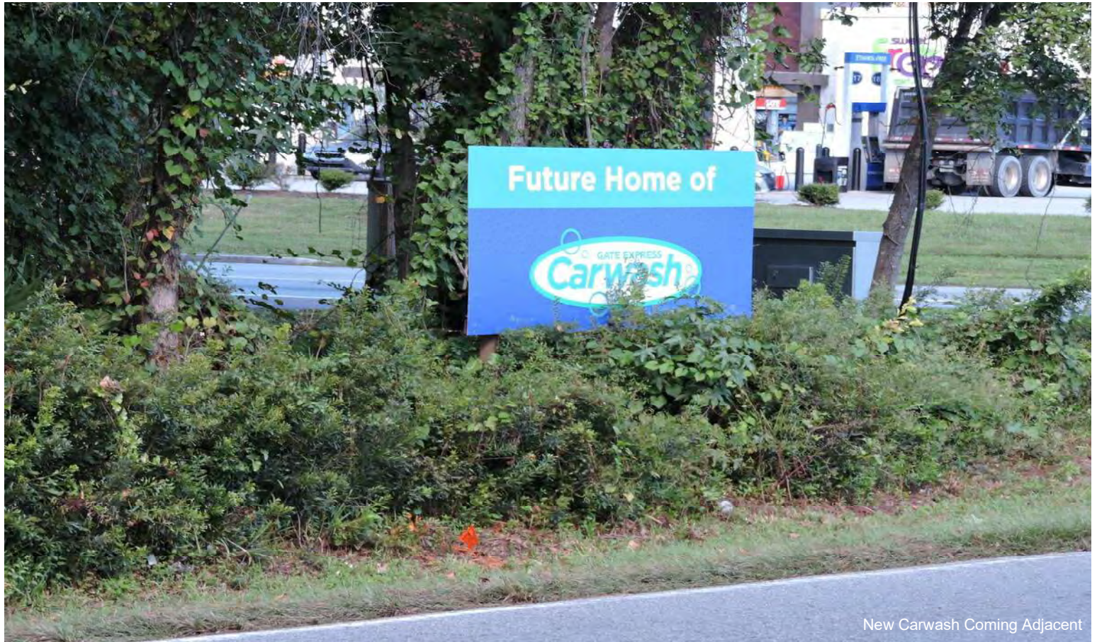
New Carwash Coming Adjacent