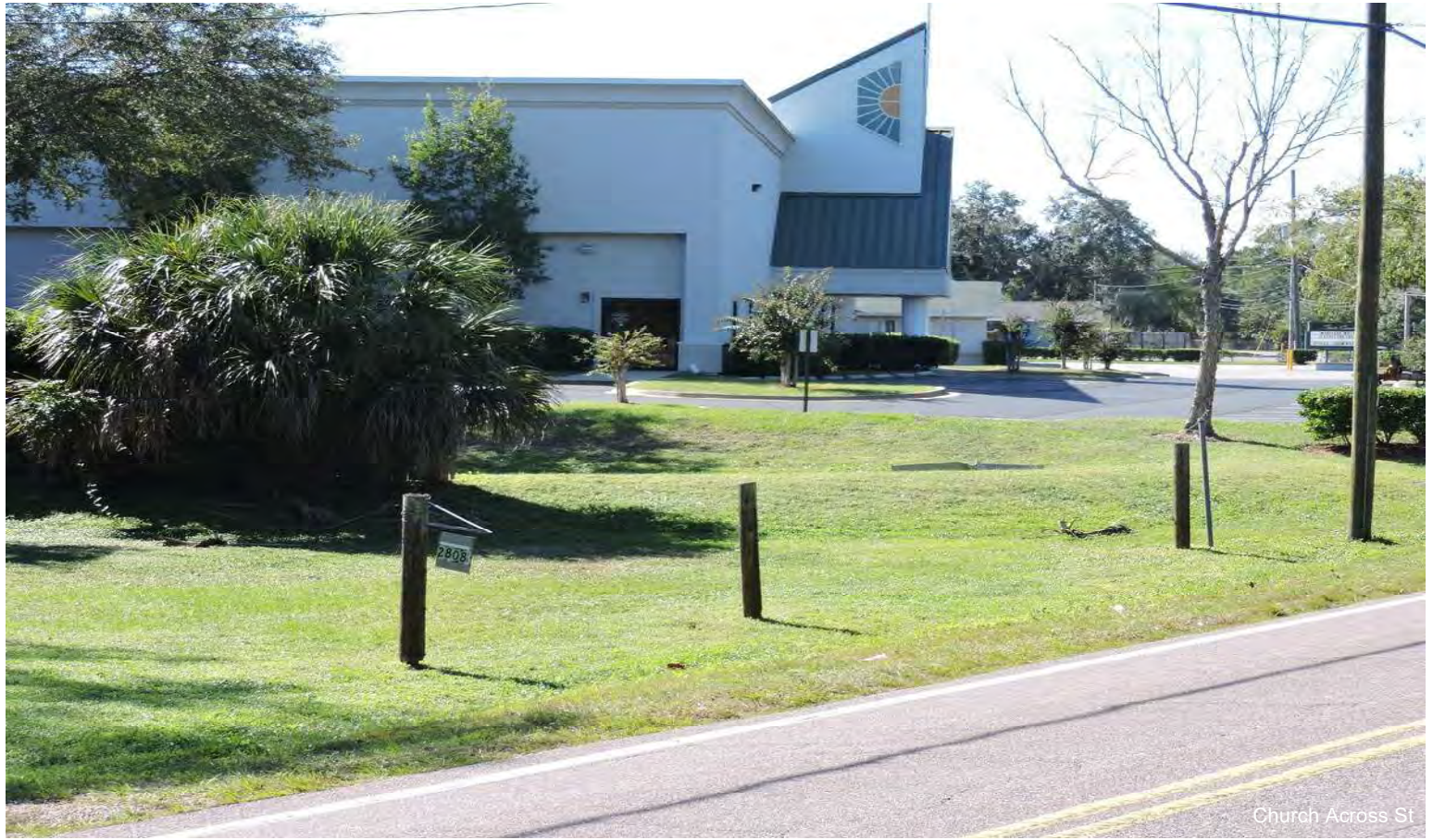
Church Across St