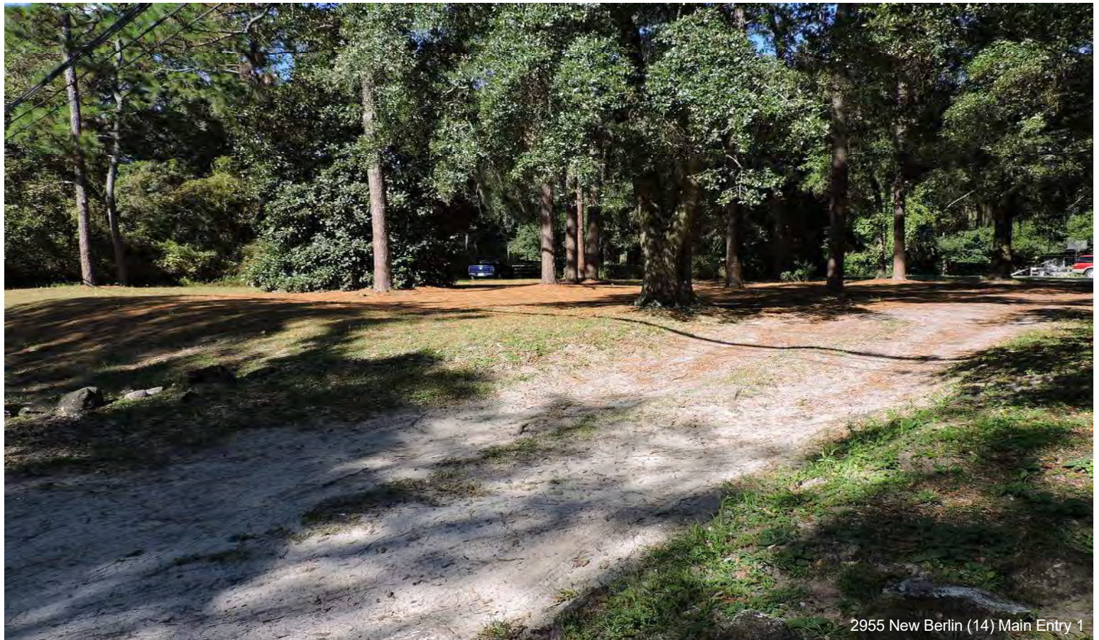
2955 New Berlin (14) Main Entry 1