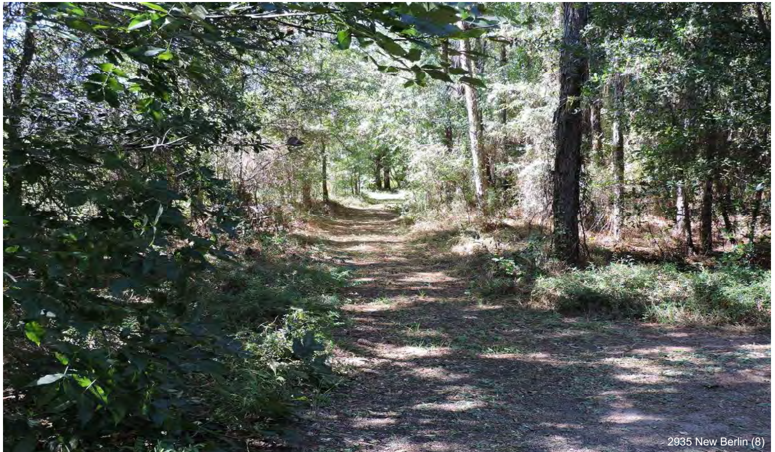
2935 New Berlin (8)