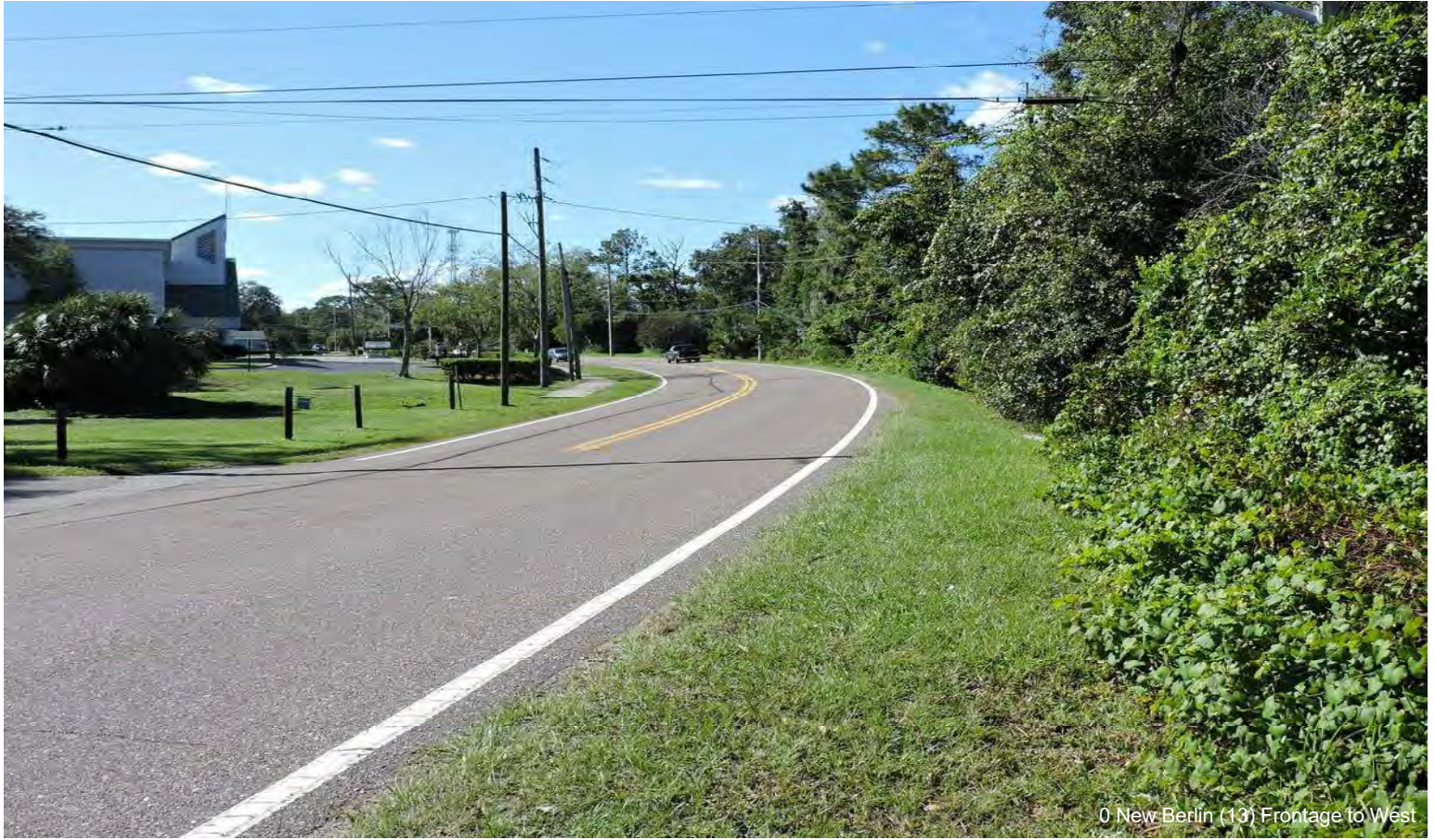
0 New Berlin (13) Frontage to West