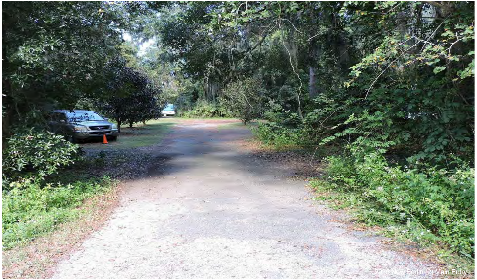
2935 New Berlin (2) Main Entry 1