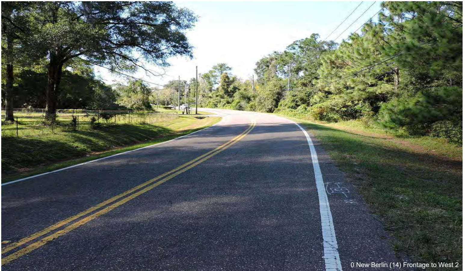
0 New Berlin (14) Frontage to West 2