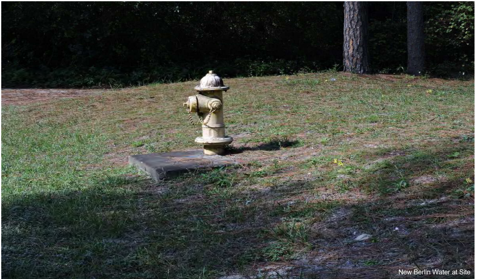
New Berlin Water at Site