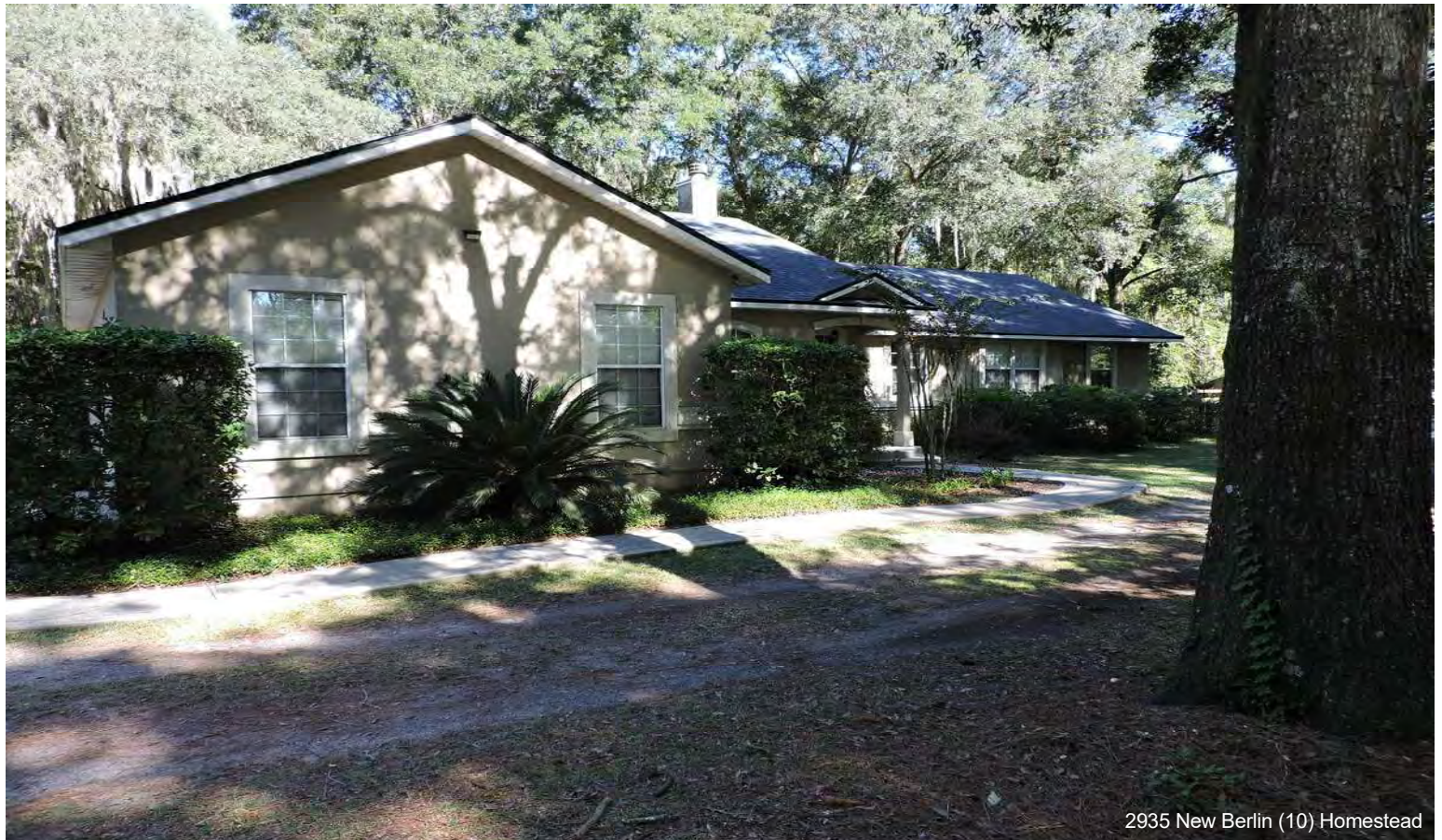
2935 New Berlin (10) Homestead