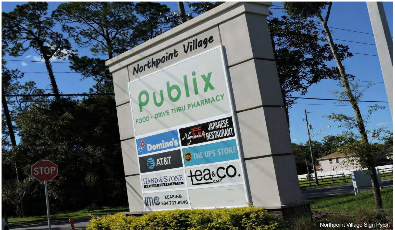
Northpoint Village Sign Pylon