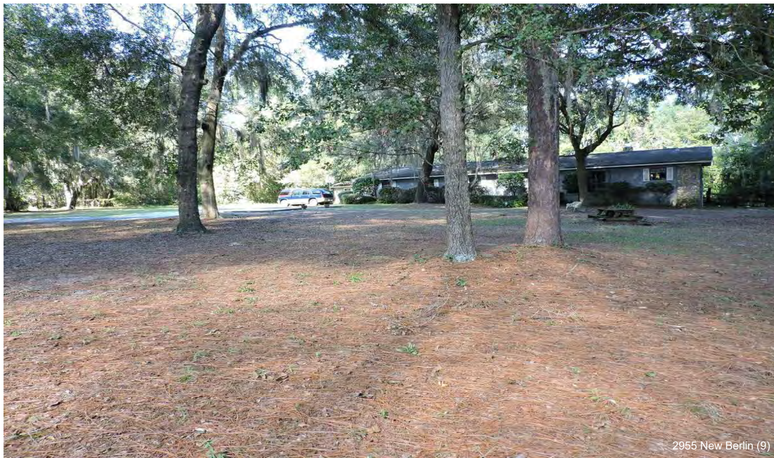
2955 New Berlin (9)