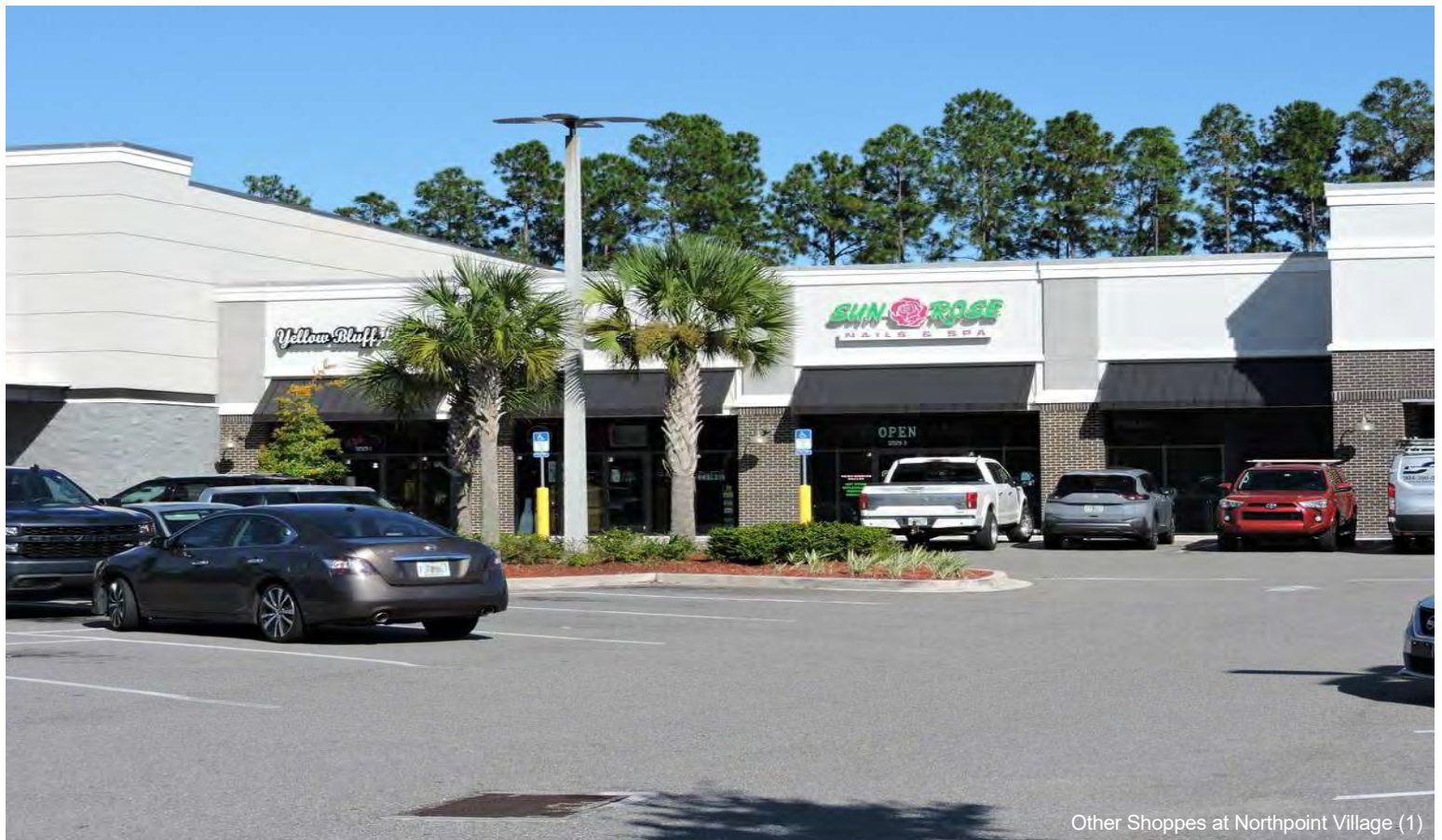
Other Shoppes at Northpointe Village (1)