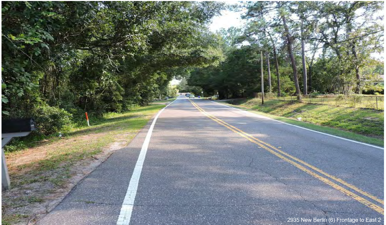
2935 New Berlin (6) Frontage to East 2