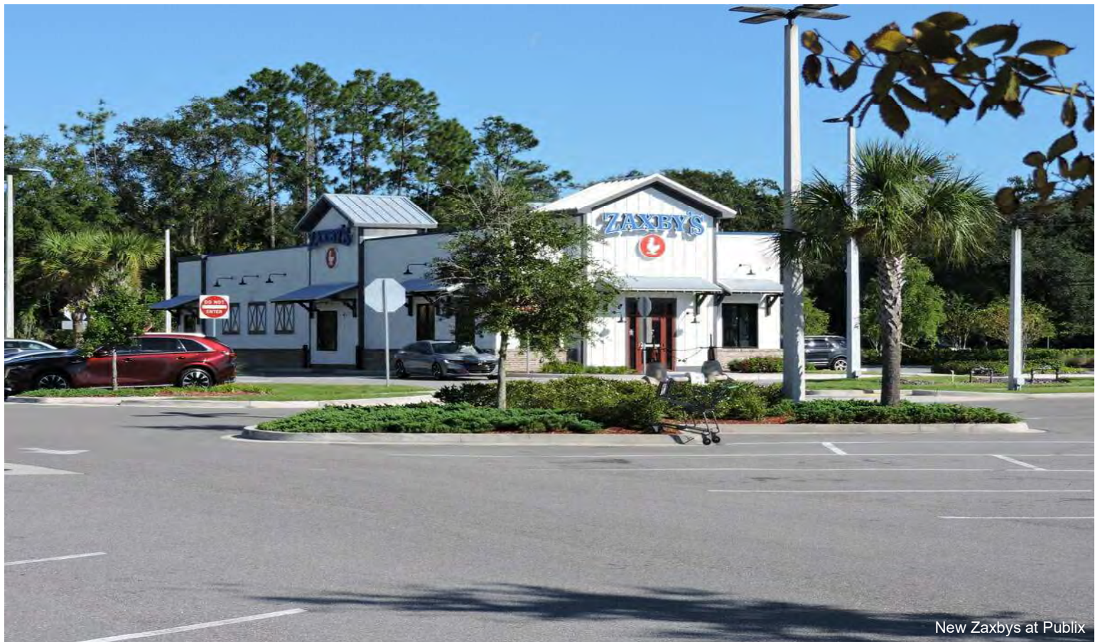
New Zaxbys at Publix