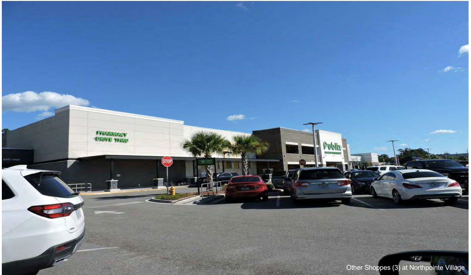
Other Shoppes (3) at Northpointe Village