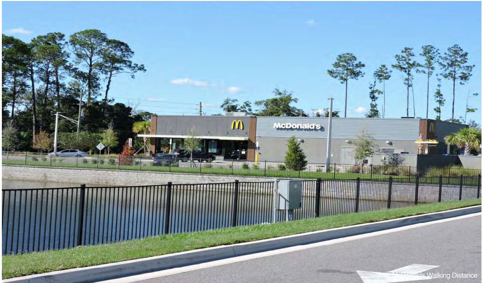
McDonald's Walking Distance