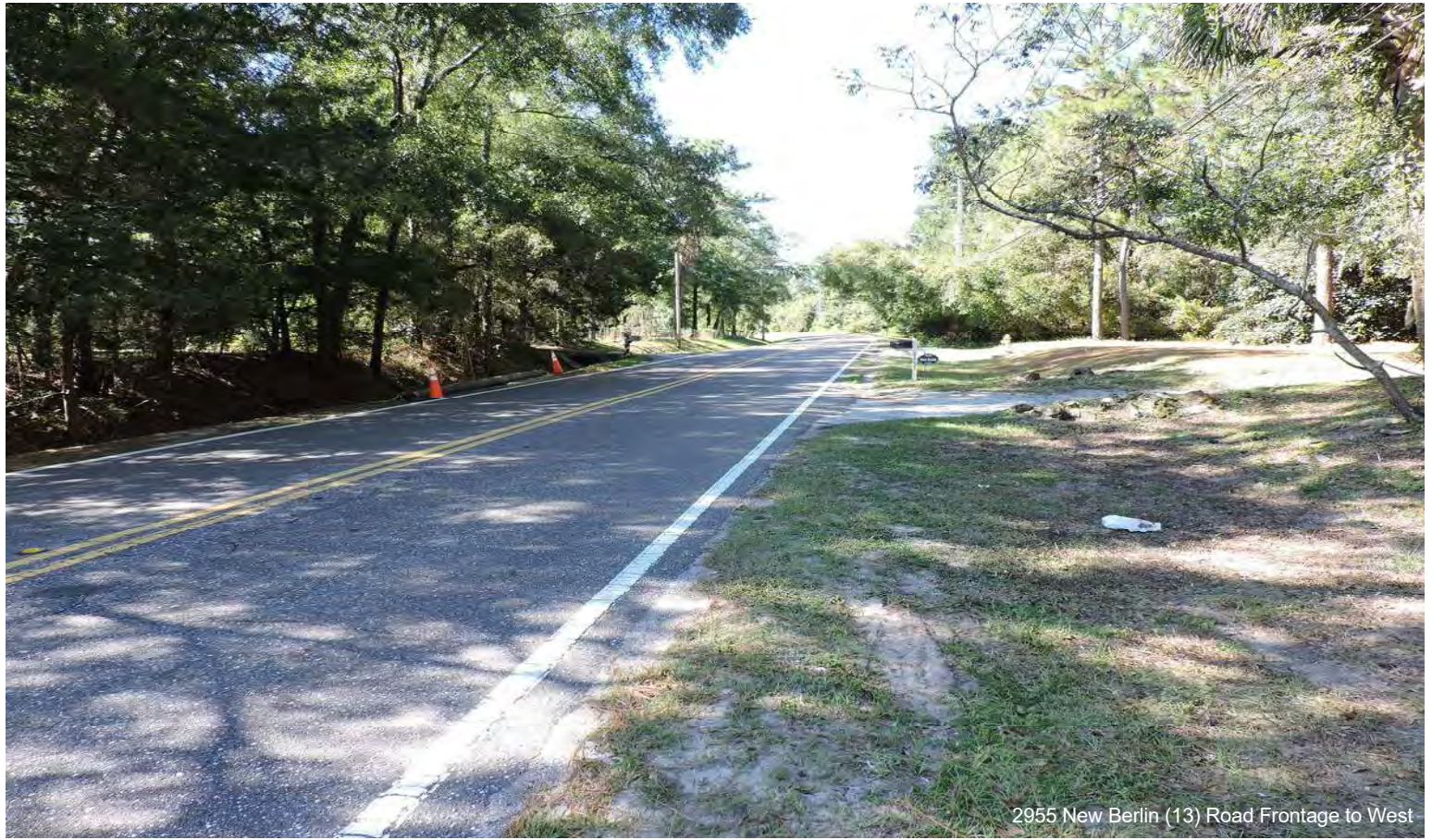
2955 New Berlin (13) Road Frontage to West