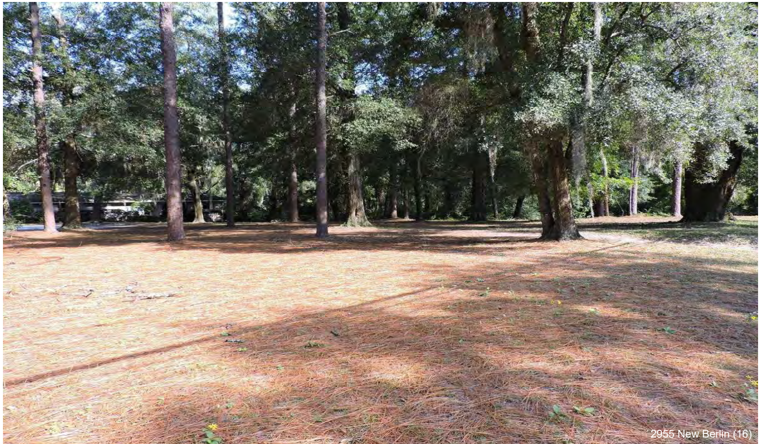
2955 New Berlin (16)