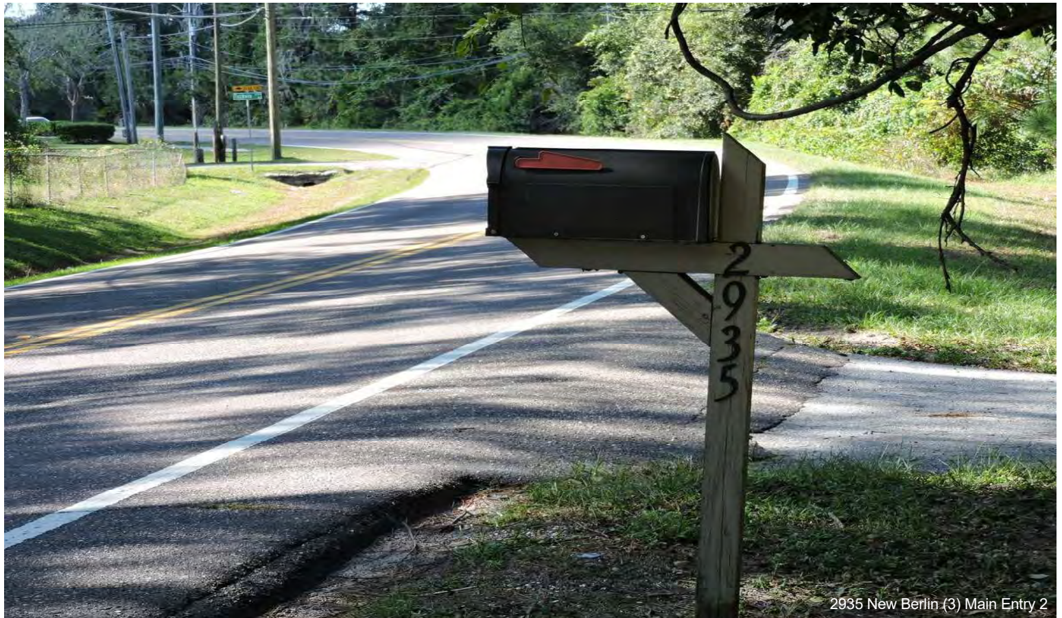
2935 New Berlin (3) Main Entry 2