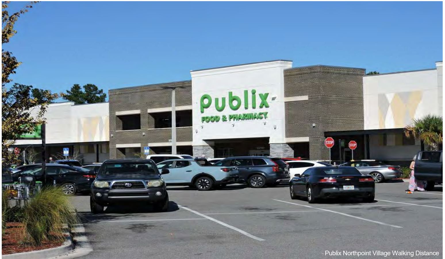
Publix Northpoint Village Walking Distance