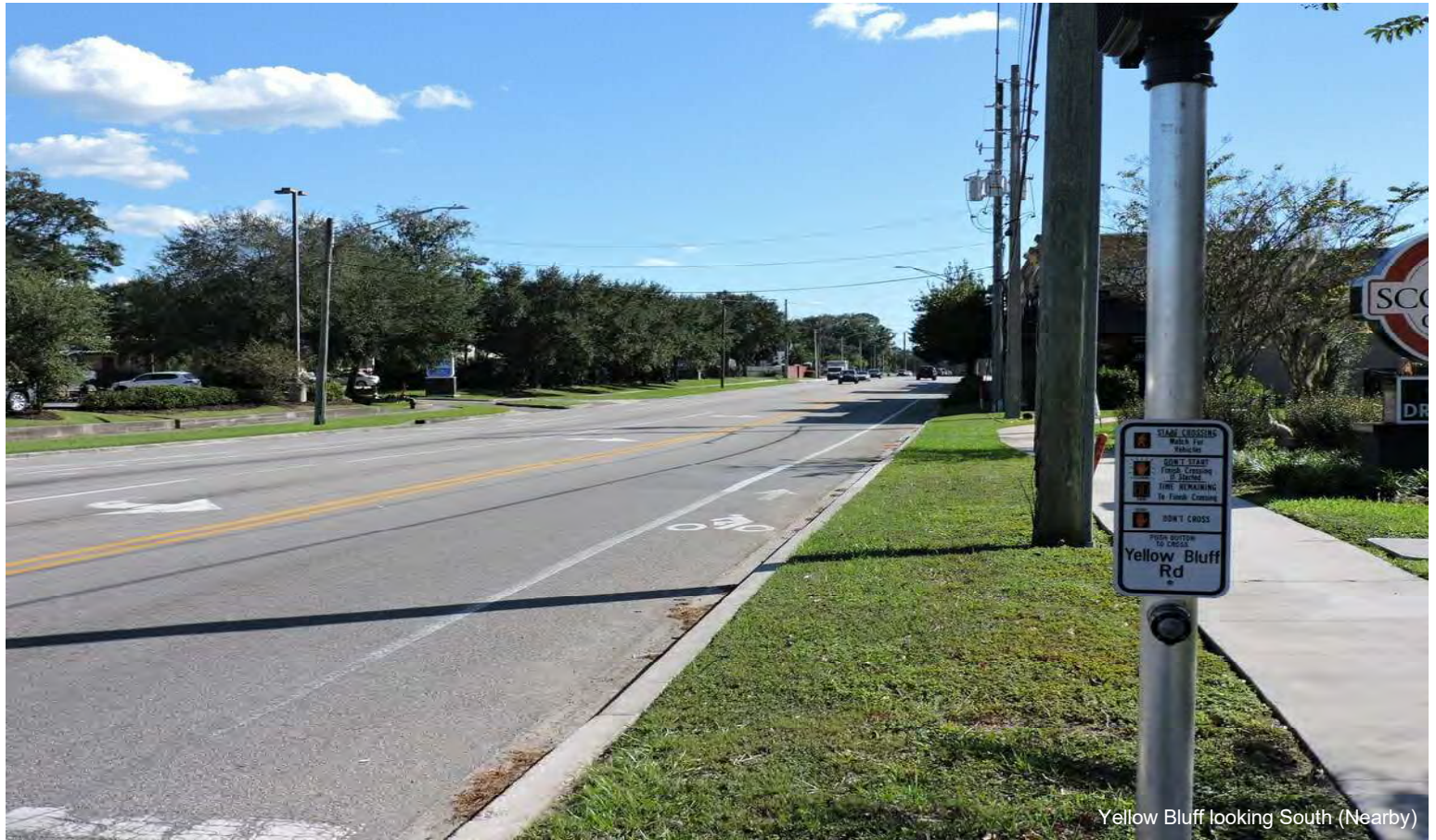
Yellow Bluff looking South (Nearby)