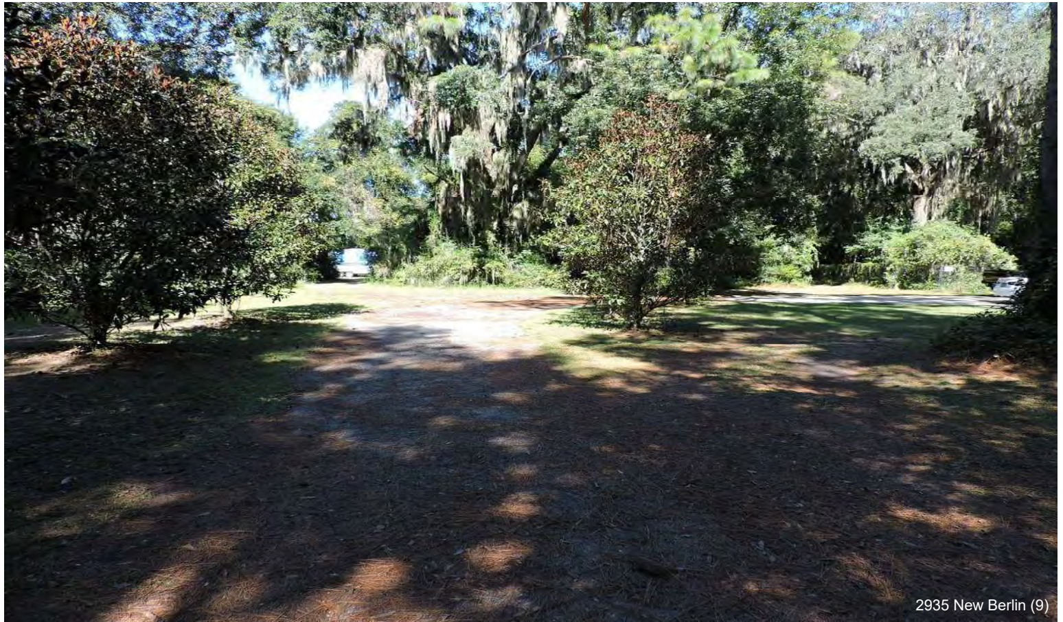
2935 New Berlin (9)