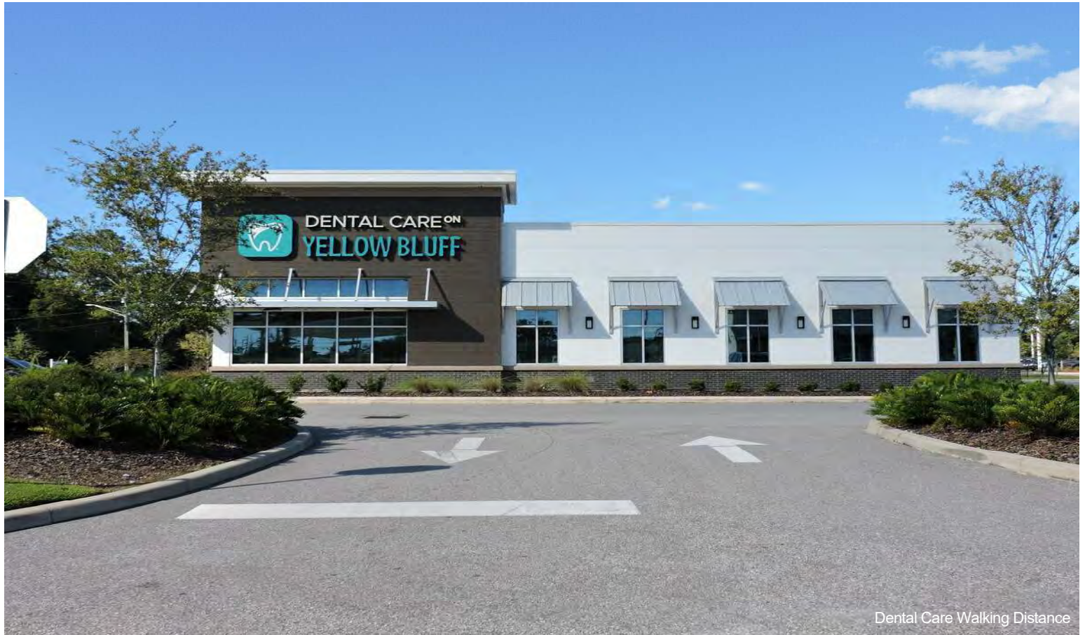
Dental Care Walking Distance