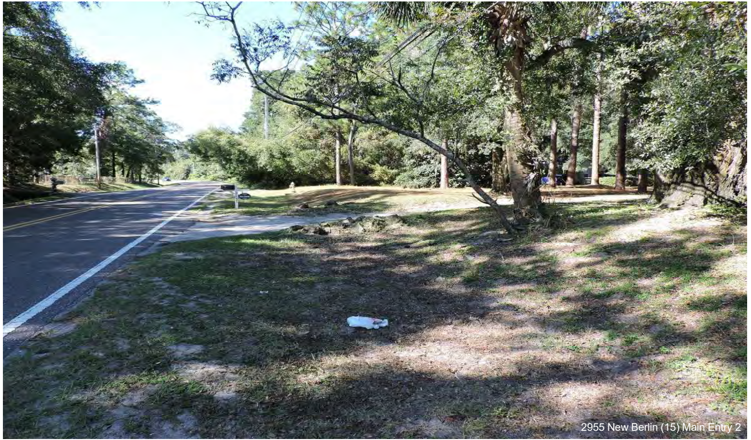
2955 New Berlin (15) Main Entry 2