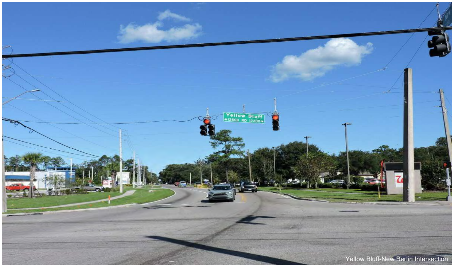
Yellow Bluff-New Berlin Intersection