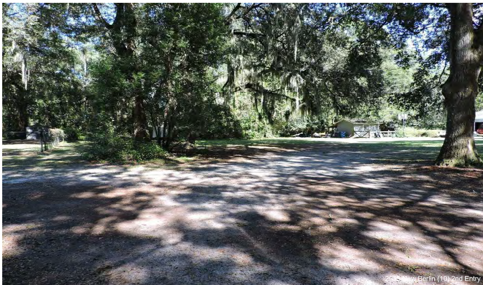
2955 New Berlin (10) 2nd Entry