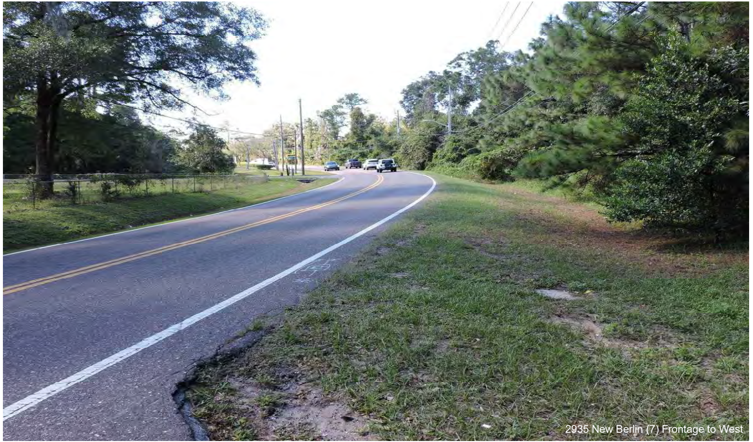
2935 New Berlin (7) Frontage to West