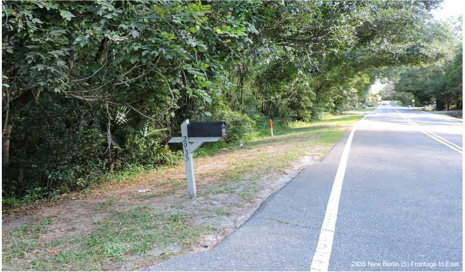
2935 New Berlin (5) Frontage to East