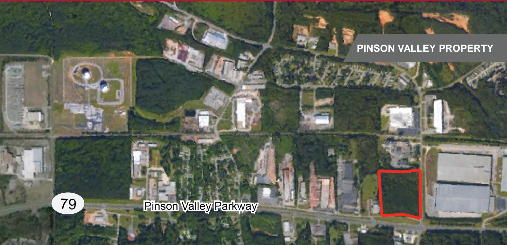
PINSON VALLEY PROPERTY

+/- 14.42 AC Industrial Land Sale Price: $699,000