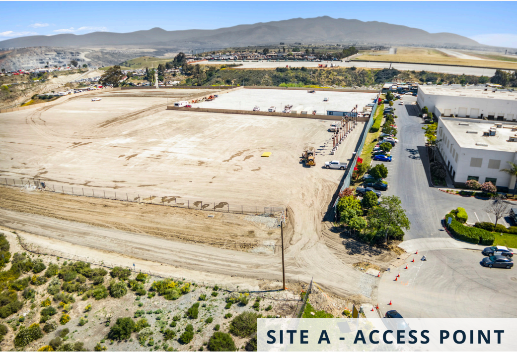
SITE A - ACCESS POINT