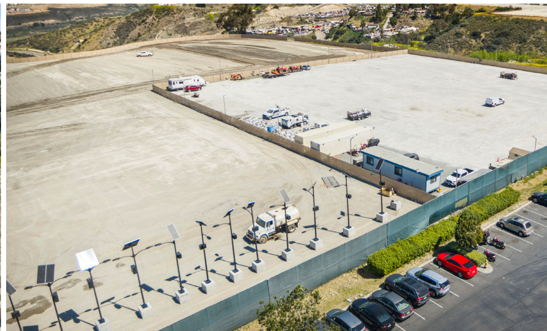
HIGH POWERED SOLAR SITE LIGHTS