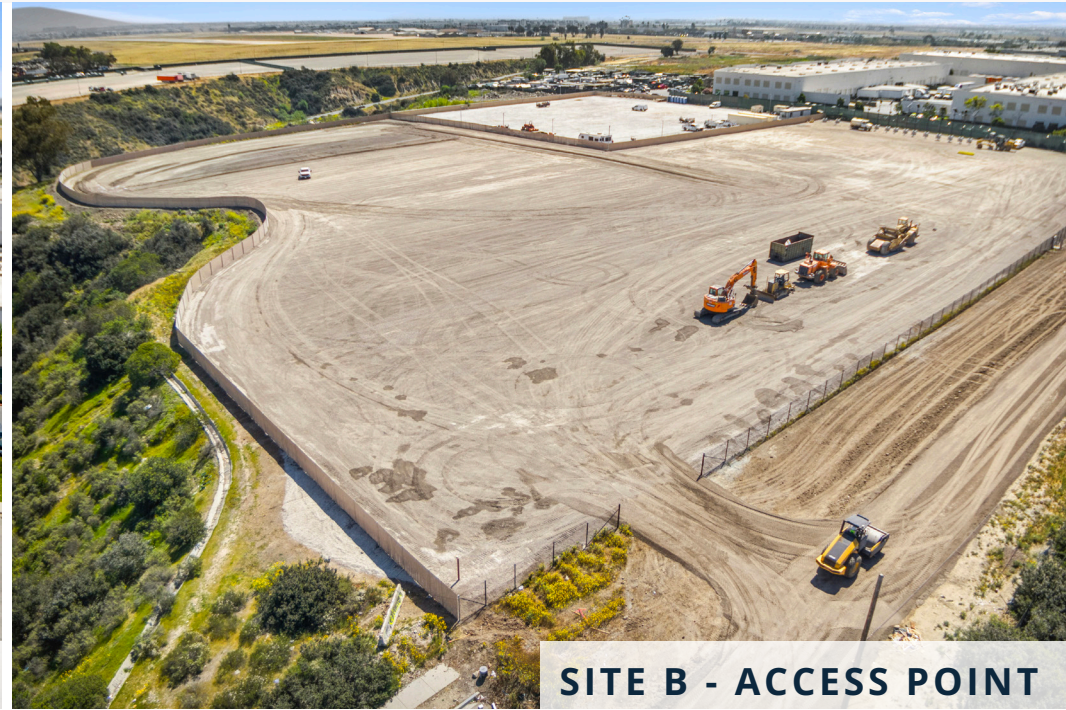
SITE B - ACCESS POINT