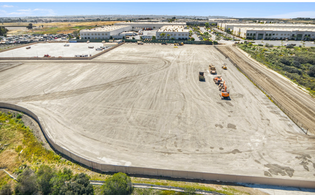
6' SLATTED SECURITY FENCING