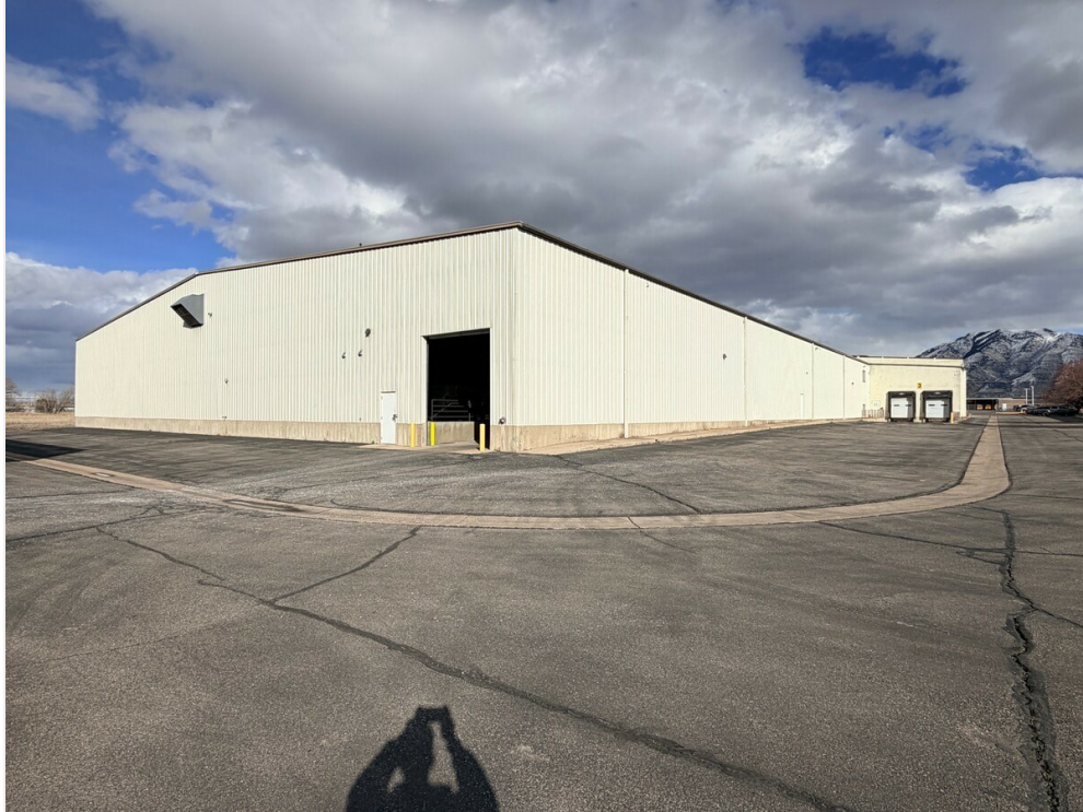
42,000 SF Warehouse