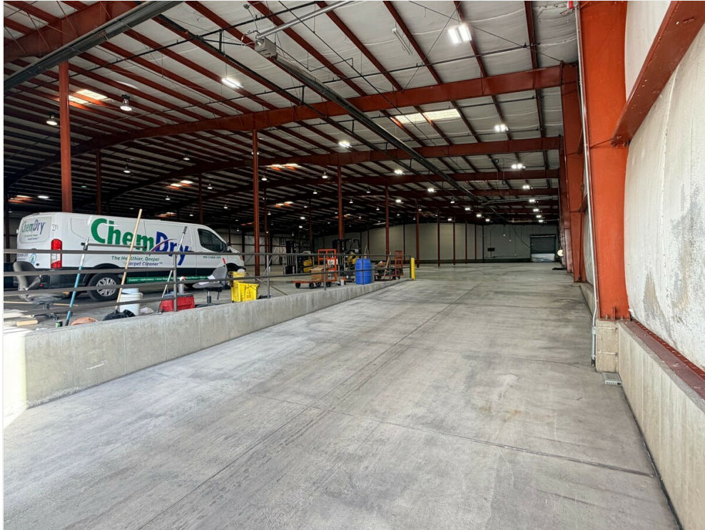
Ground level access