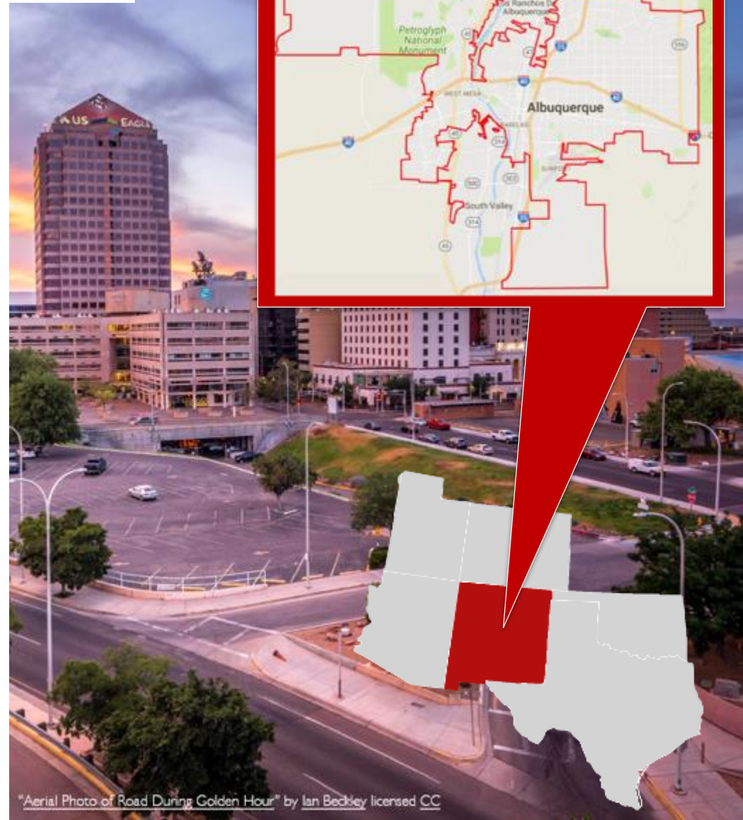
"Aerial Photo of Road During Golden Hour"

FOR SALE 3550 ISLETA BLVD SW, ALBUQUERQUE, NM 87105