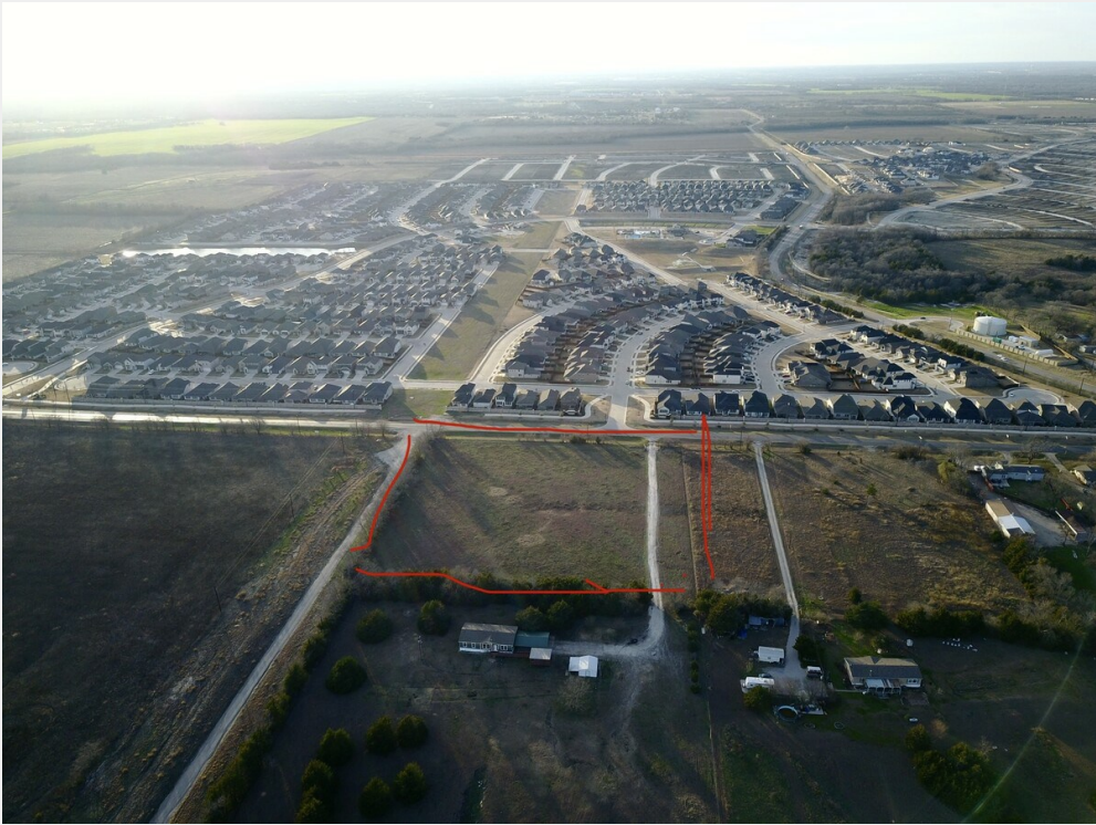
4 Acres Lease Land