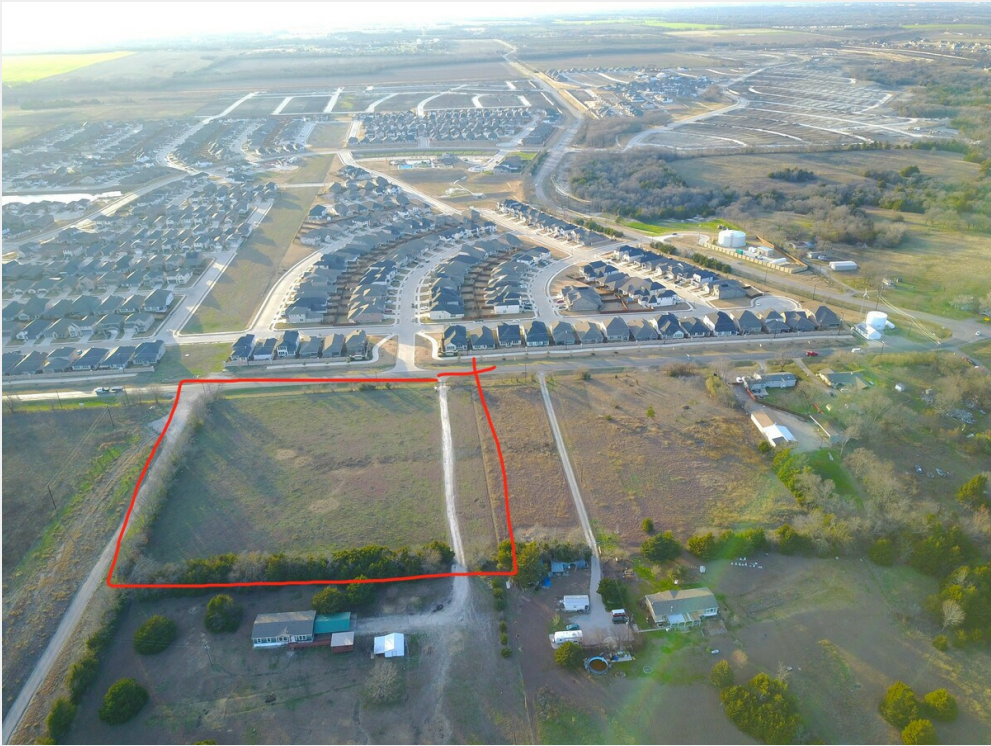
4 Acres Lease Land