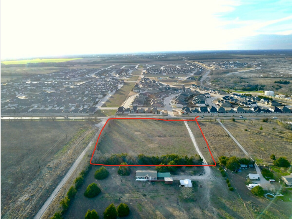
4 Acres Lease Land