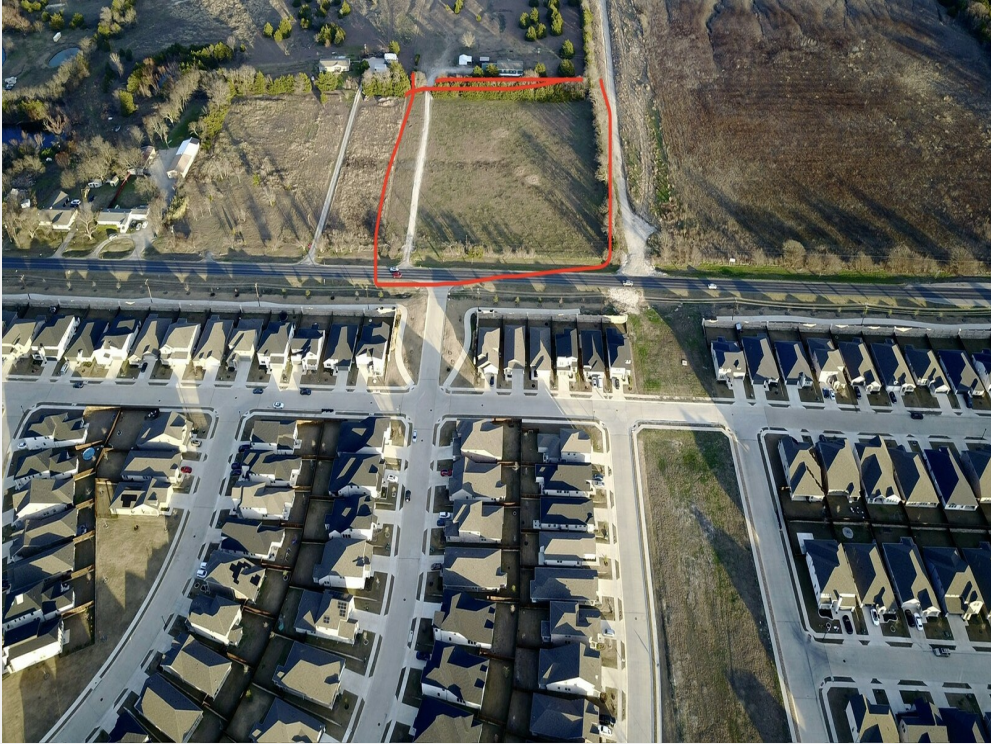
4 Acres Land for Lease