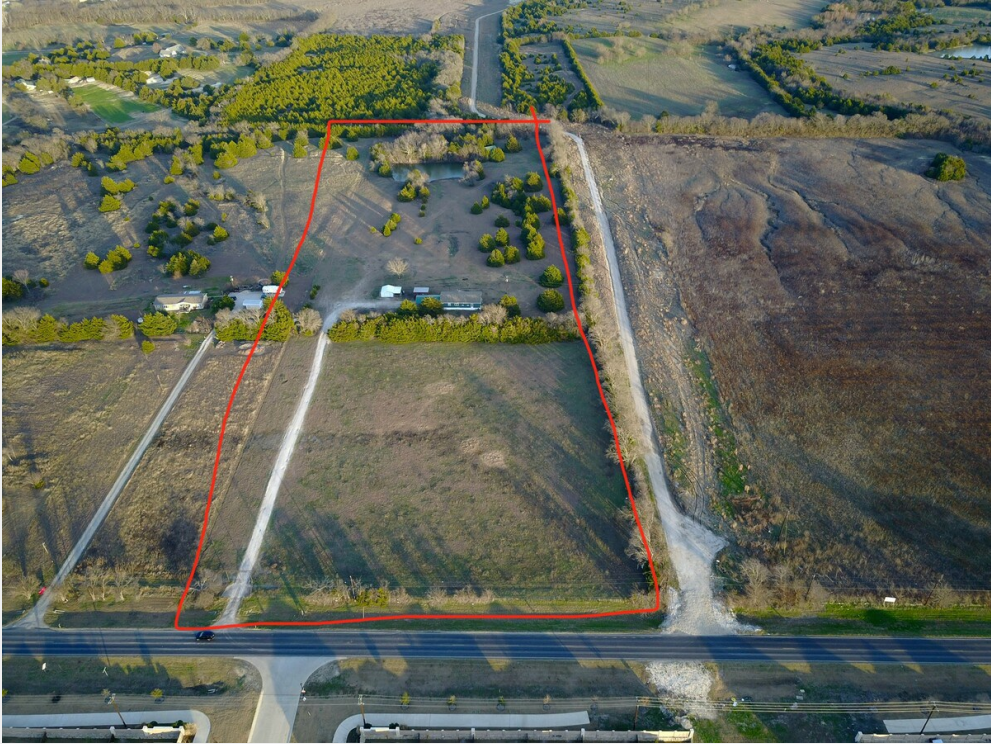
All 13 Acres Land for Lease