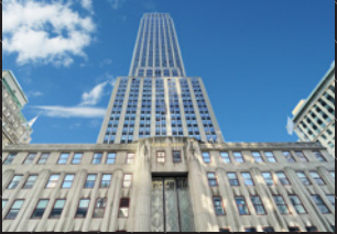
Empire State Building