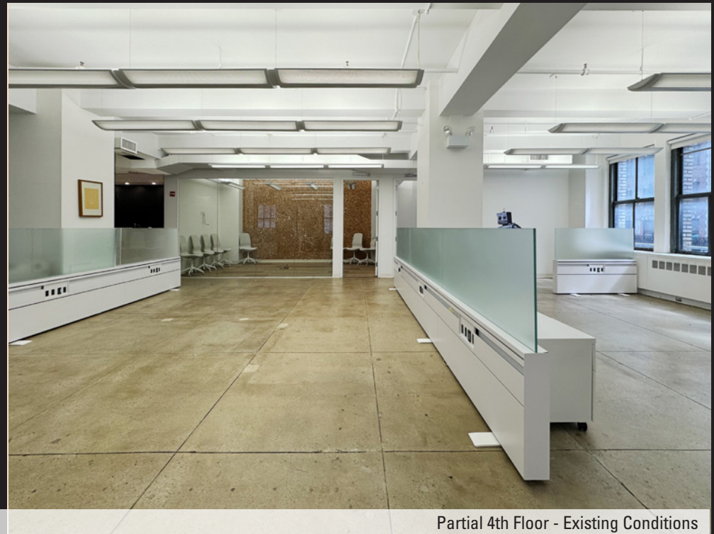
Partial 4th Floor - Existing Conditions

ABS Partners Real Estate, as the exclusive agent is pleased to offer the following opportunity for lease: