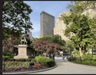
Madison Square Park