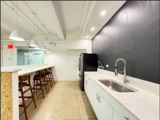
(for descriptive purposes only; not to scale.)