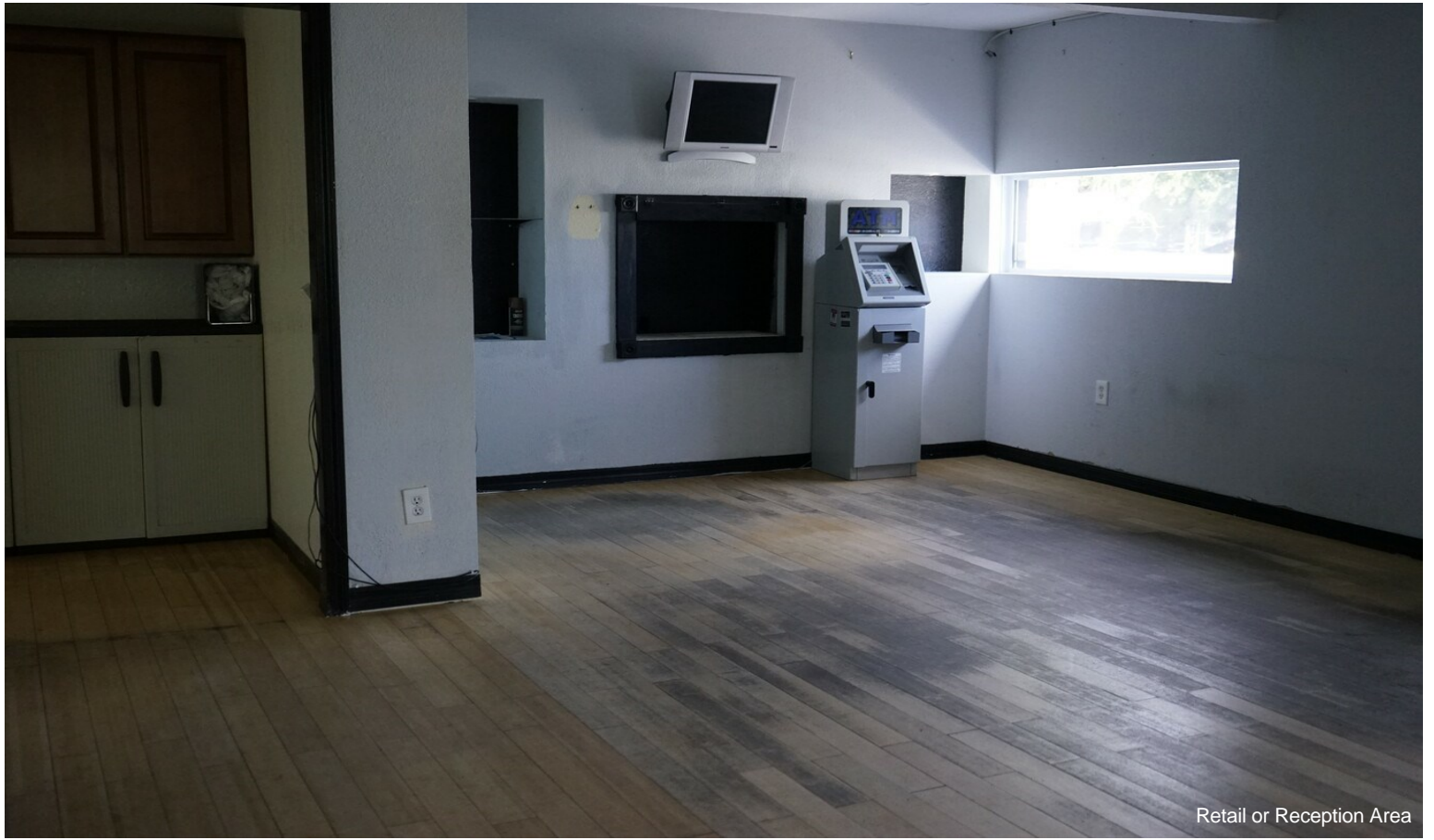
Retail or Reception Area