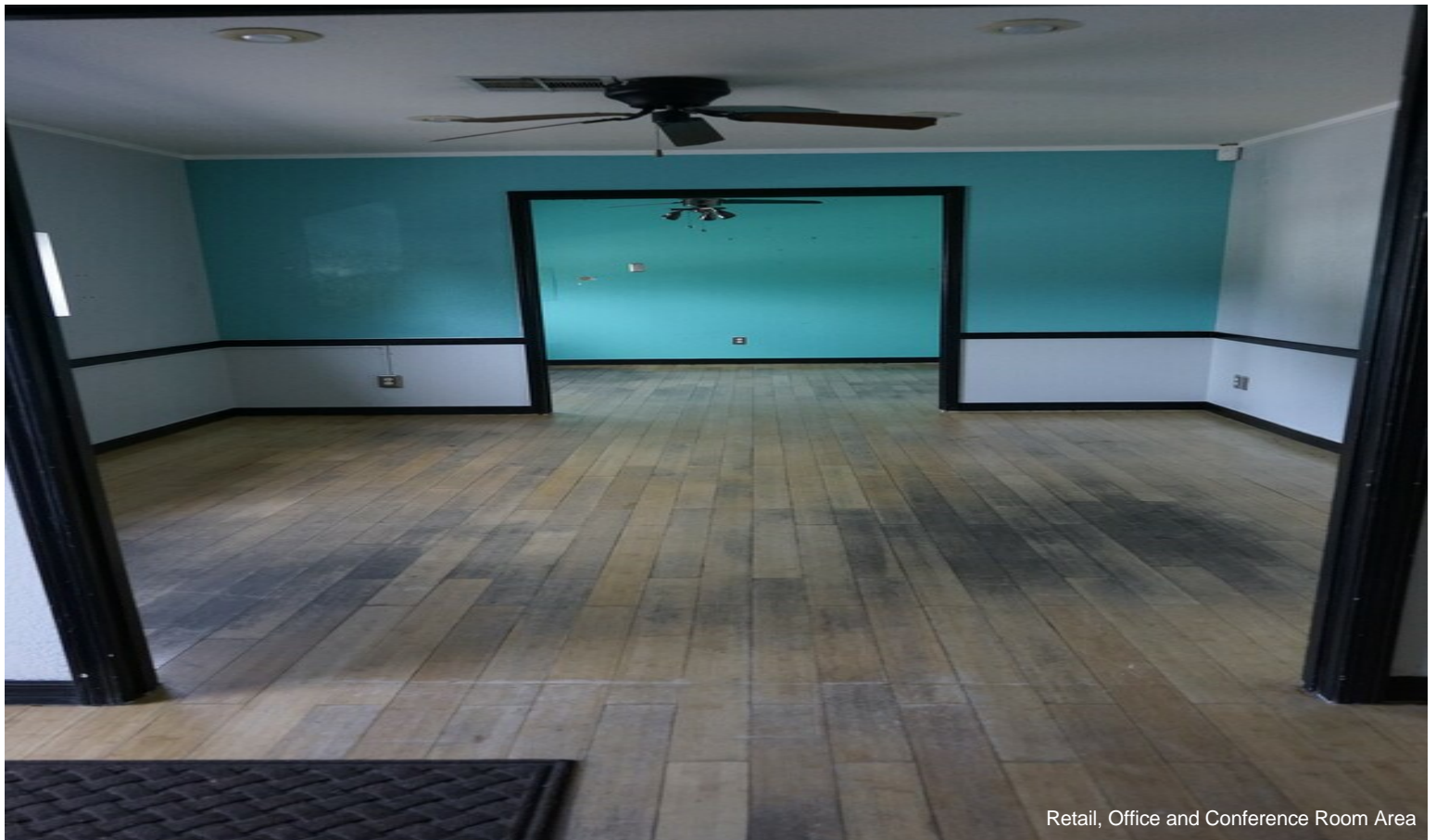
Retail, Office and Conference Room Area