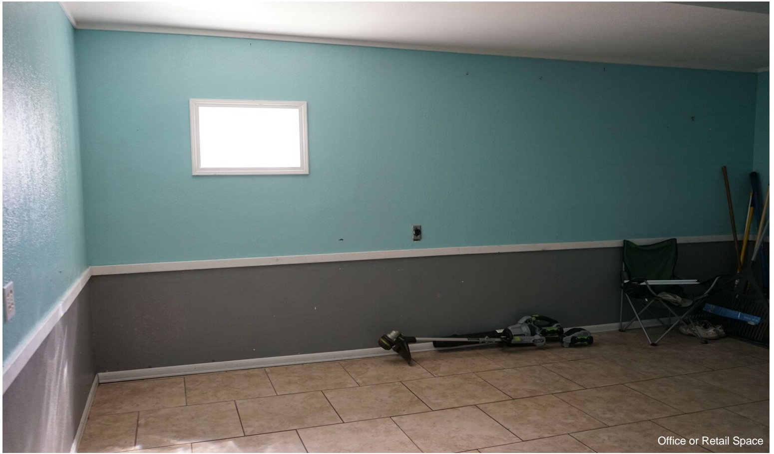
Office or Retail Space