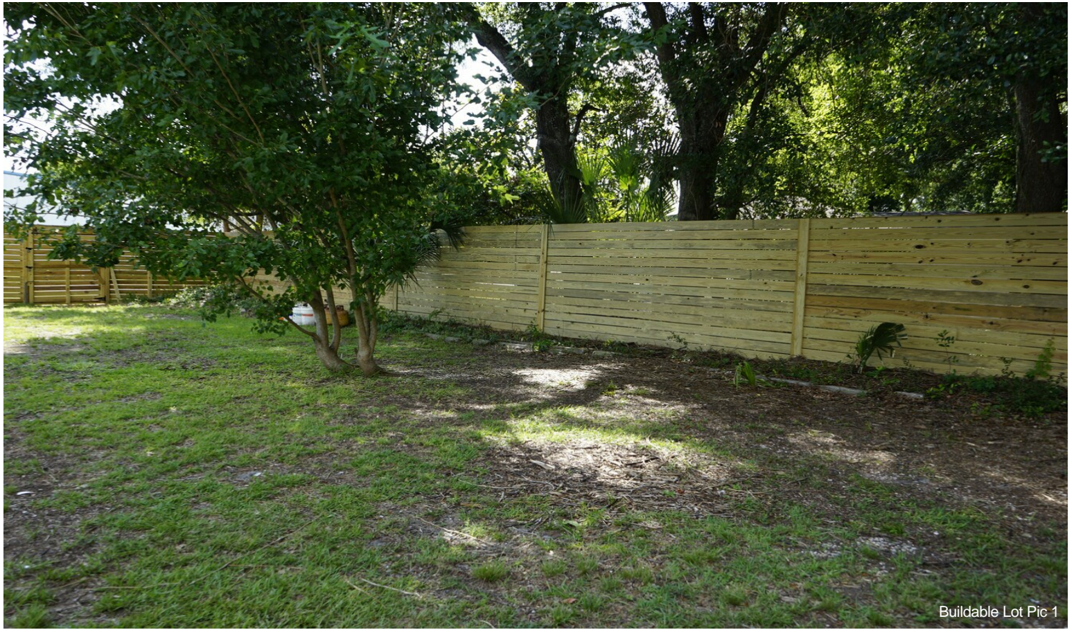
Buildable Lot Pic 1