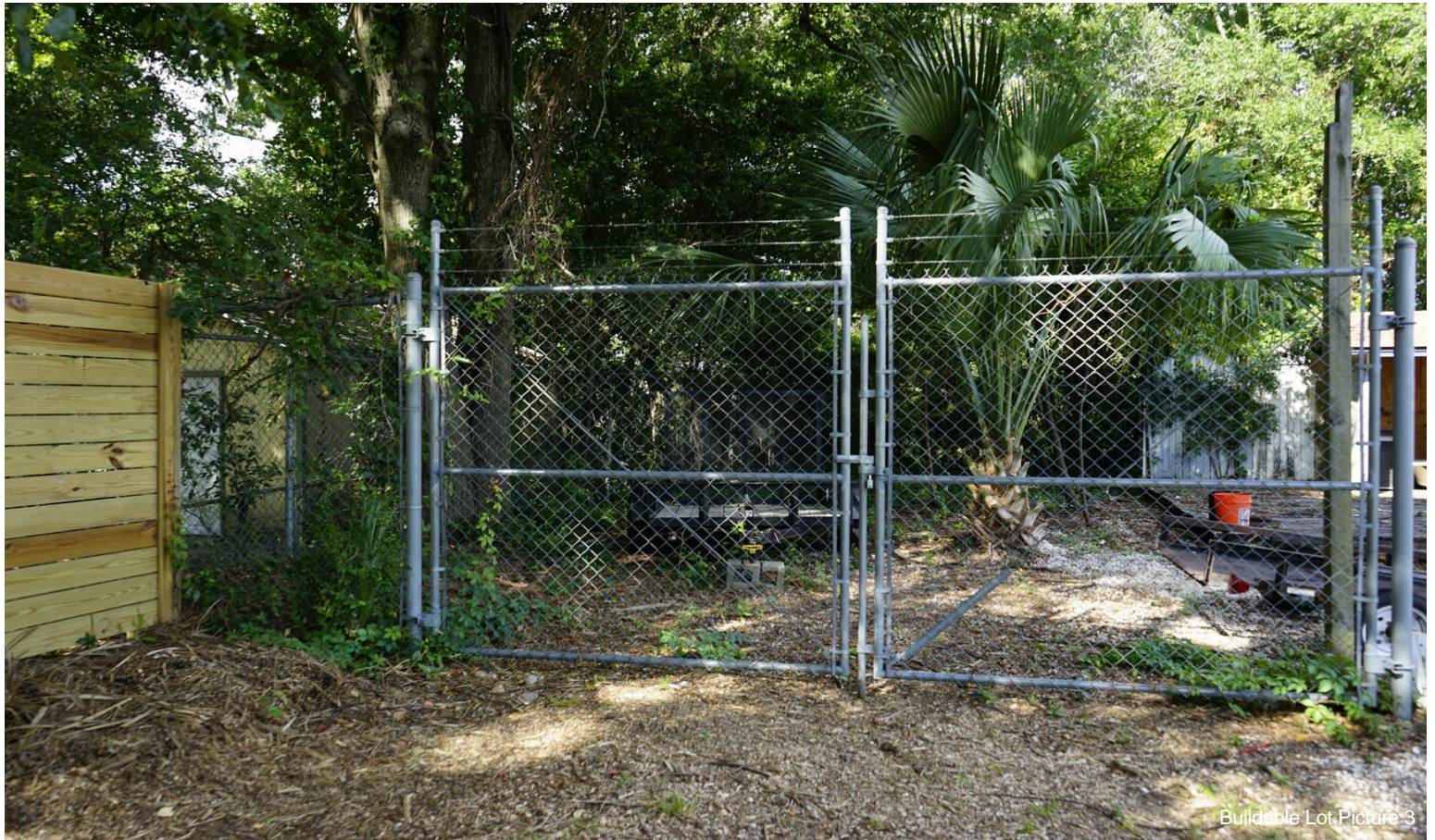
Buildable Lot, Picture 3