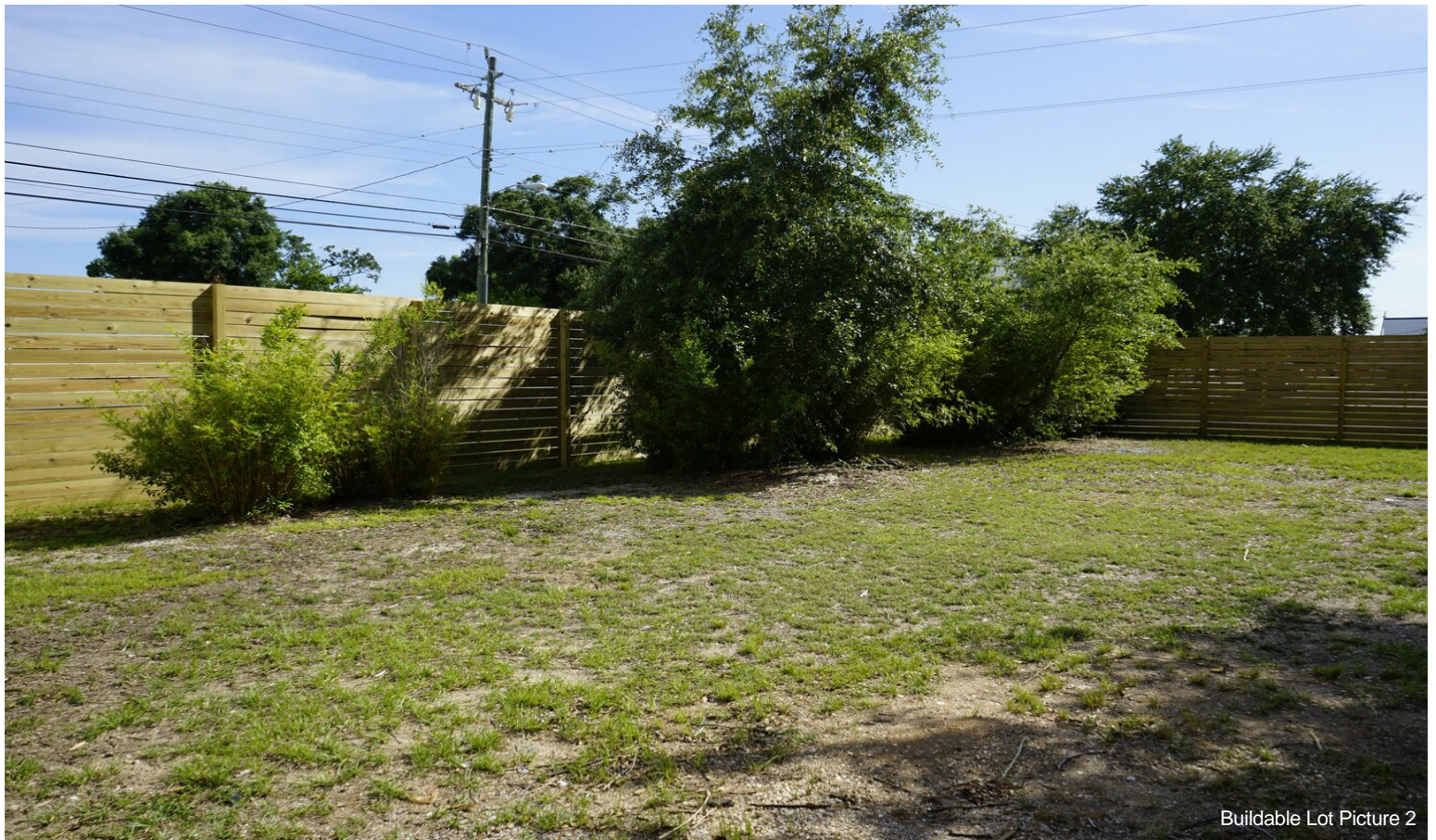
Buildable Lot Picture 2