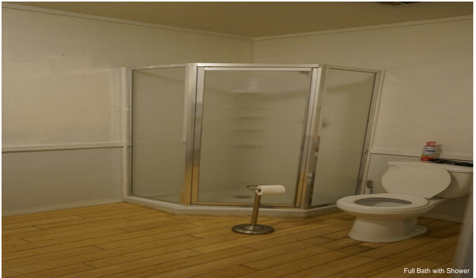
Full Bath with Shower