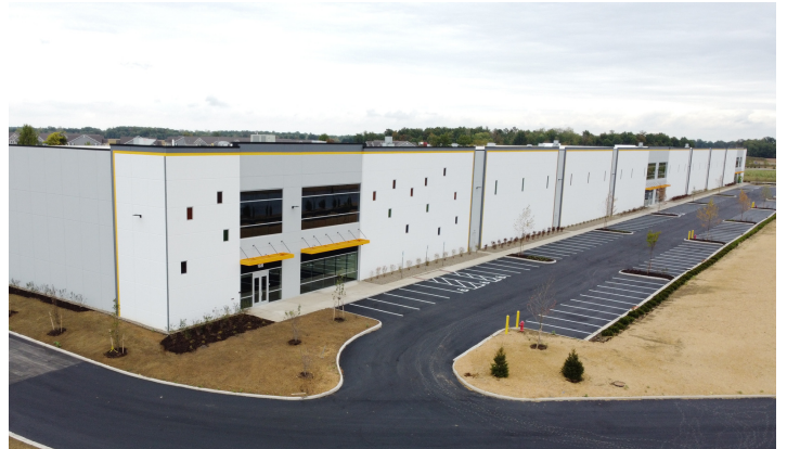
250,829 SF - Available