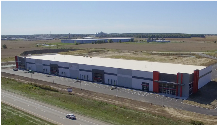
Building 1 - 84,000 SF Fully Leased