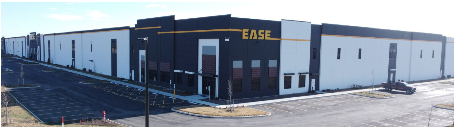
EASE Innovation Center - 308,358 SF