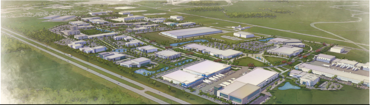
33 Innovation Park Rendering