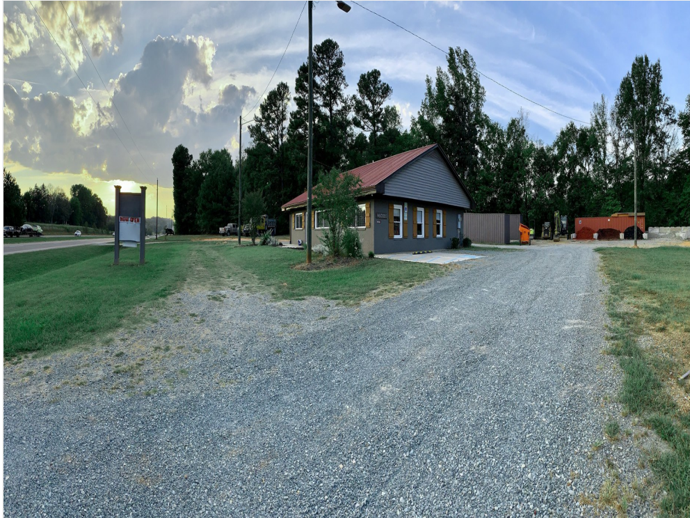
2019 Renovated Building. Leased.