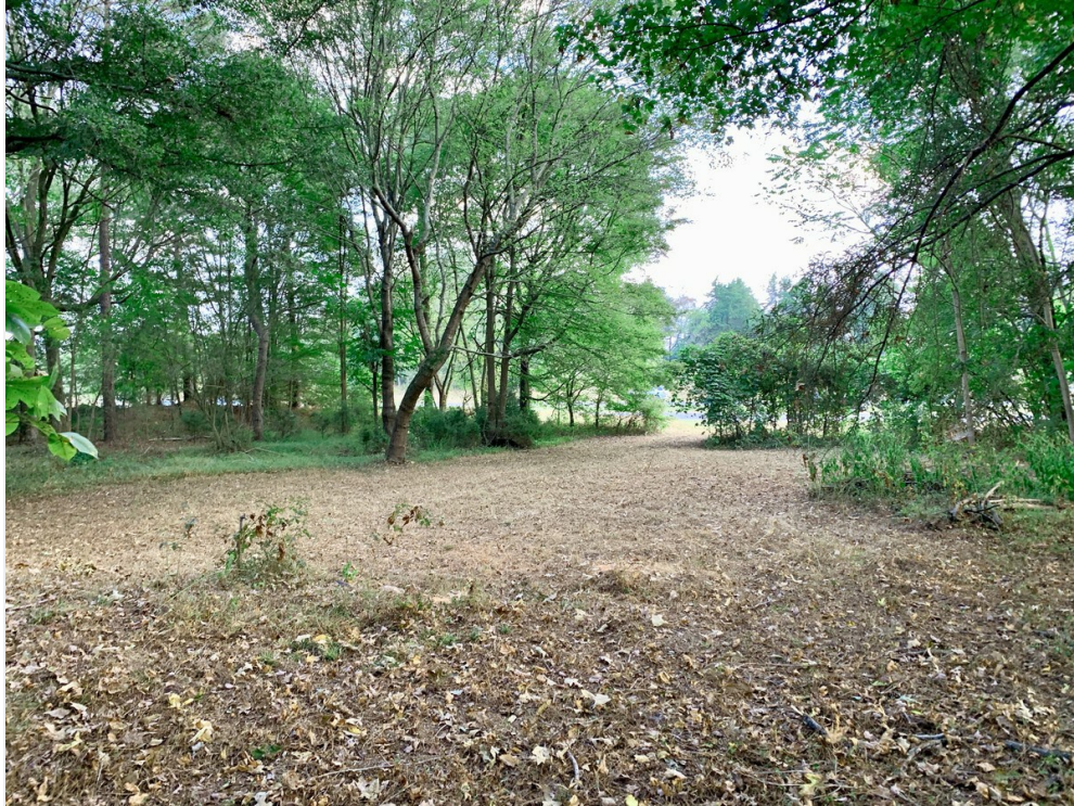
Area has separate septic and City Water Tap.