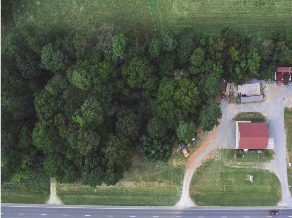
Partial Aerial Photo