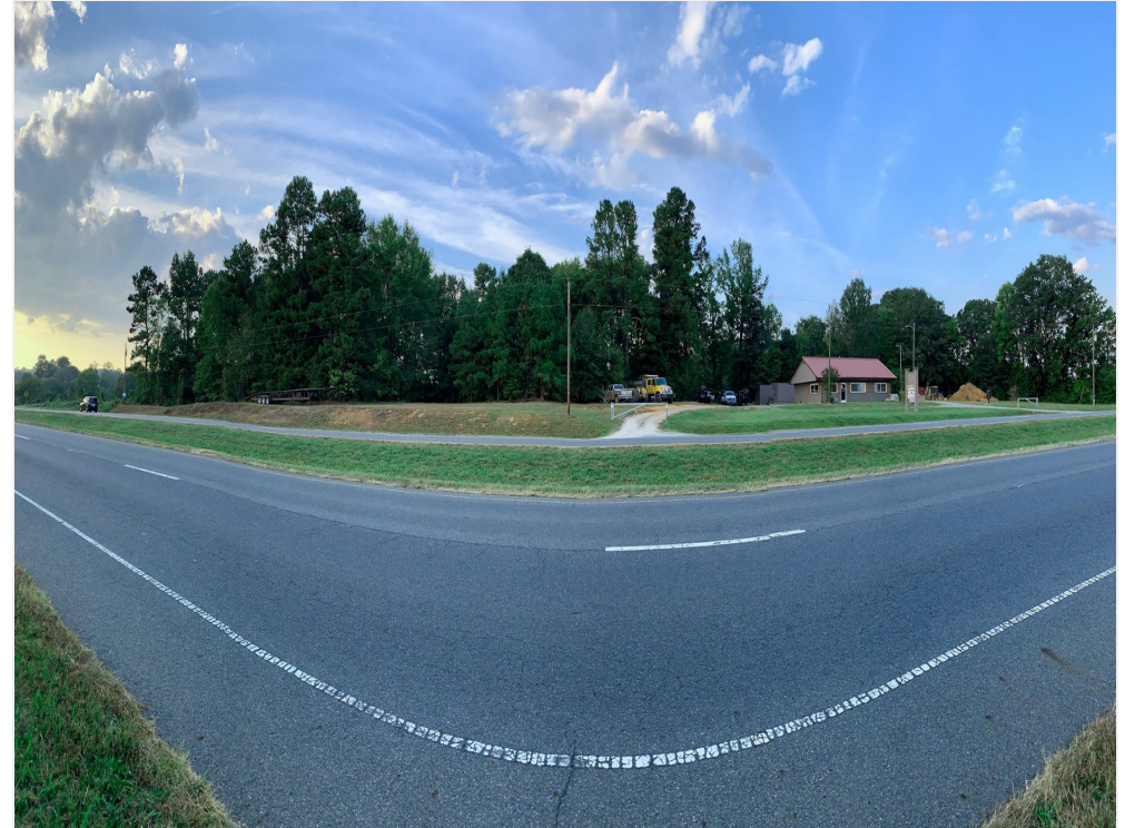
630' Feet of Road Frontage On US Highway 64