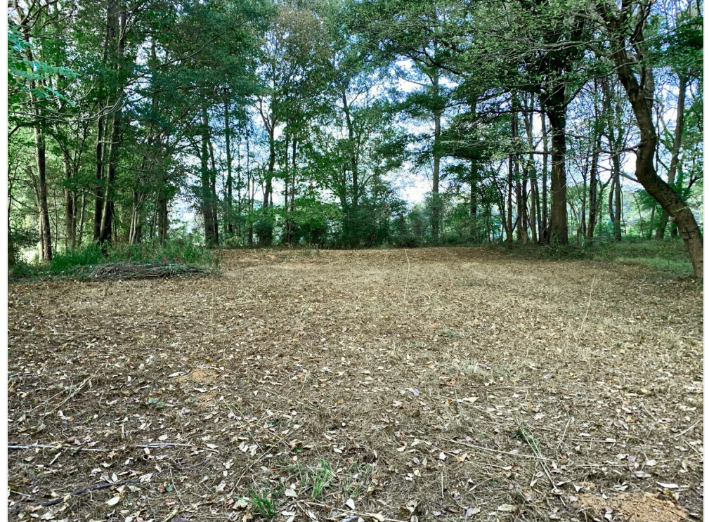
Area has separate septic and City Water Tap.