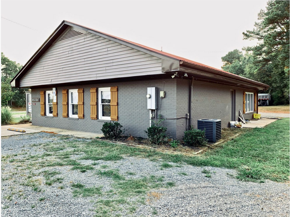
2019 Renovated Building. Leased.