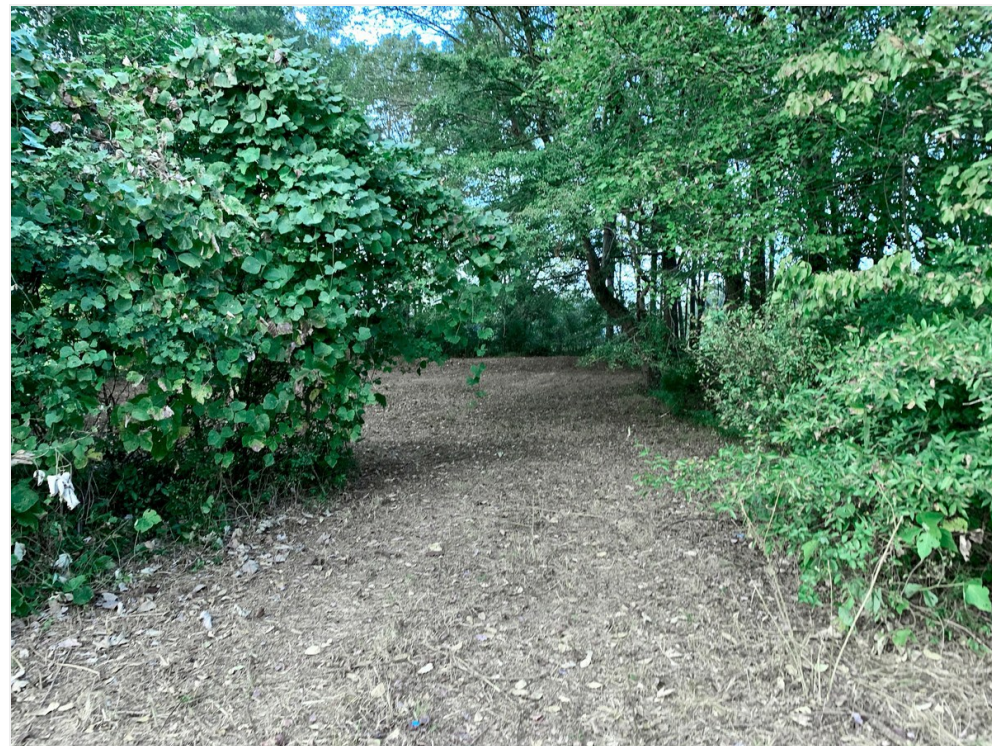
Entrance to Cleared Area.