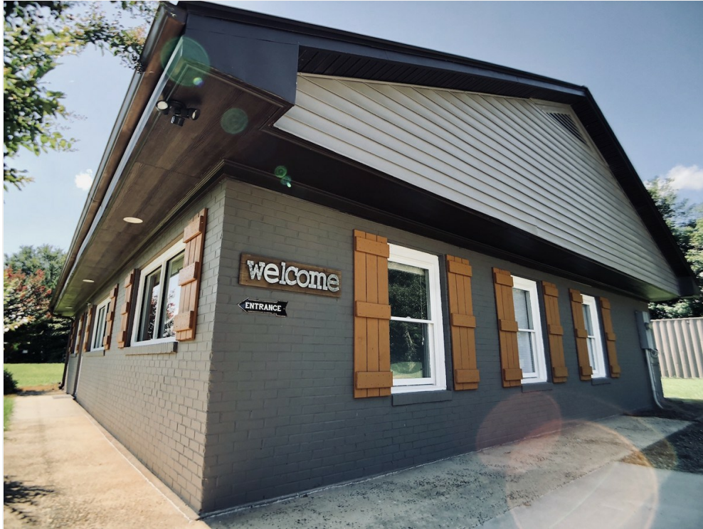
2019 Renovated Building. Leased.