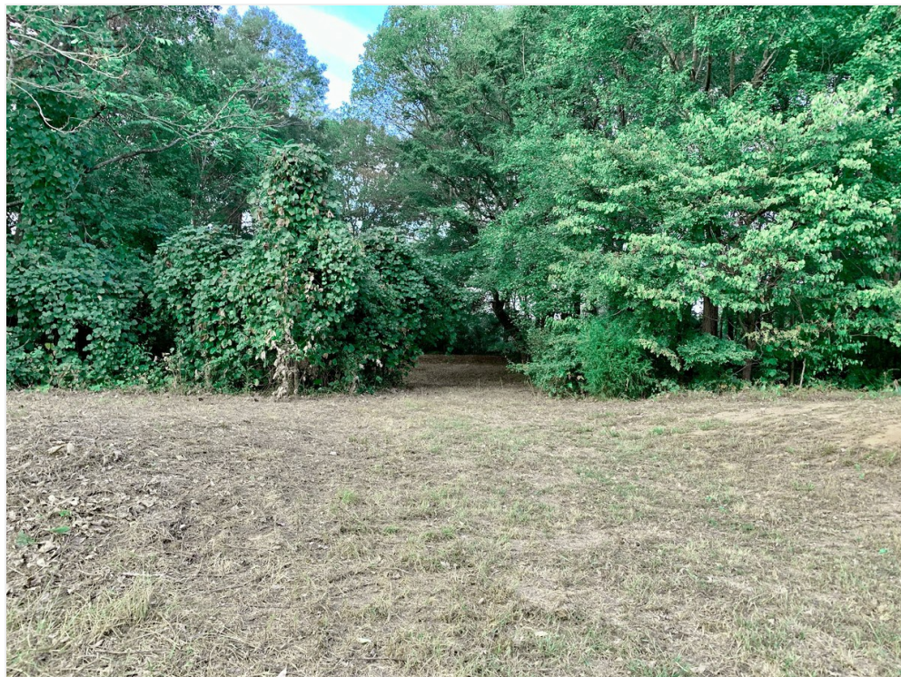
Entrance to Cleared Area.