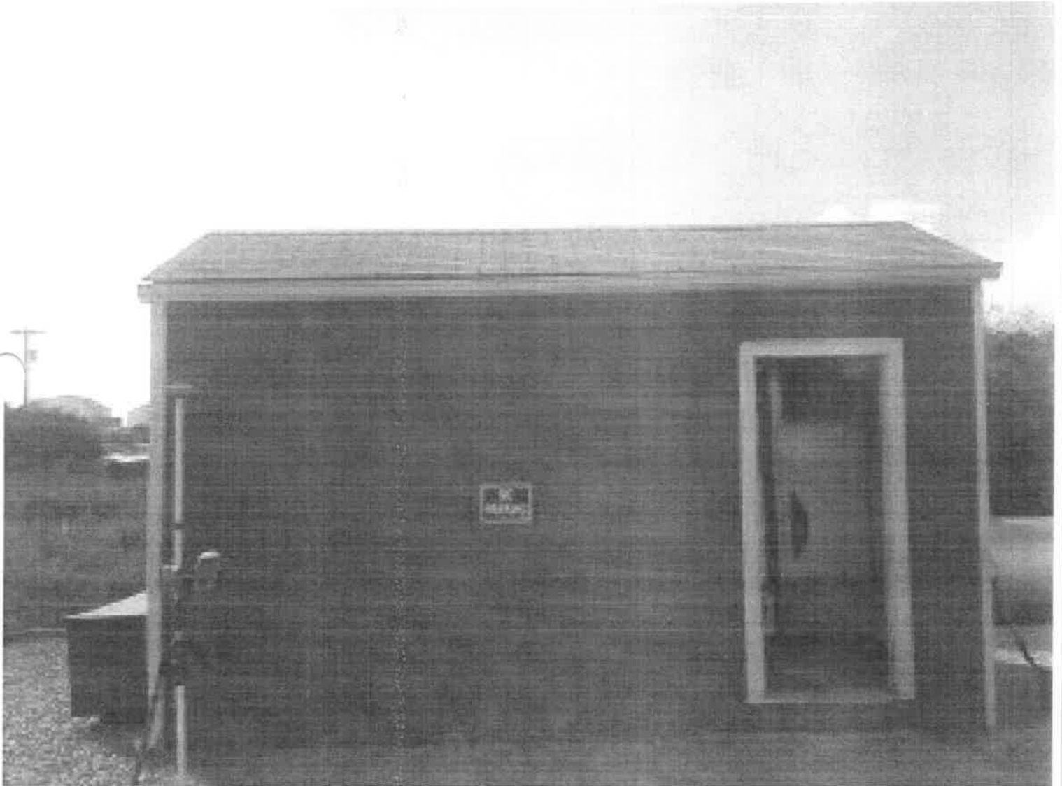
Front View (Road Side)

If using the Elevation Certificate to obtain NFIP flood insurance, affix at least 2 building photographs below according to the instructions for Item A6. Identify all photographs with date taken; "Front View" and "Rear View"; and, if required, "Right Side View" and "Left Side View." When applicable, photographs must show the foundation with representative examples of the flood openings or vents, as indicated in Section A8. If submitting more photographs than will fit on this page, use the Continuation Page.