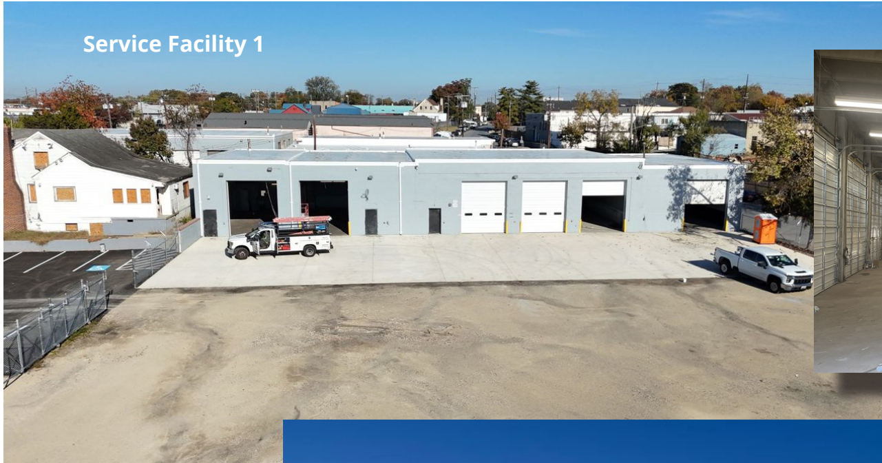
Service Facility 1