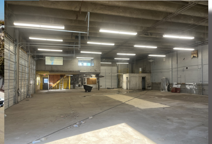
Service Facility 2