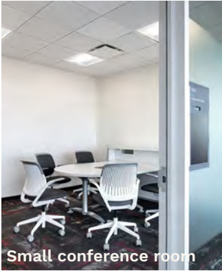
Small conference room