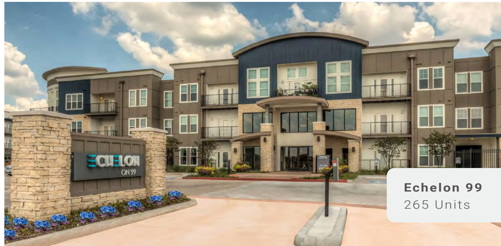
Echelon 99 265 Units