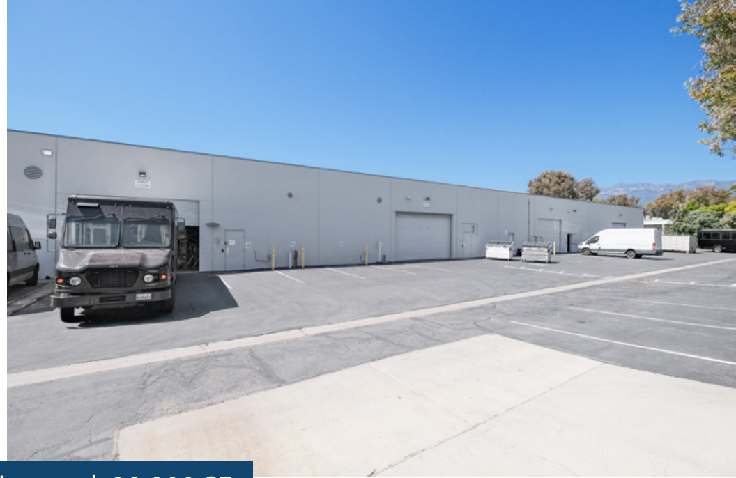
Building C | Warehouse | 28,800 SF