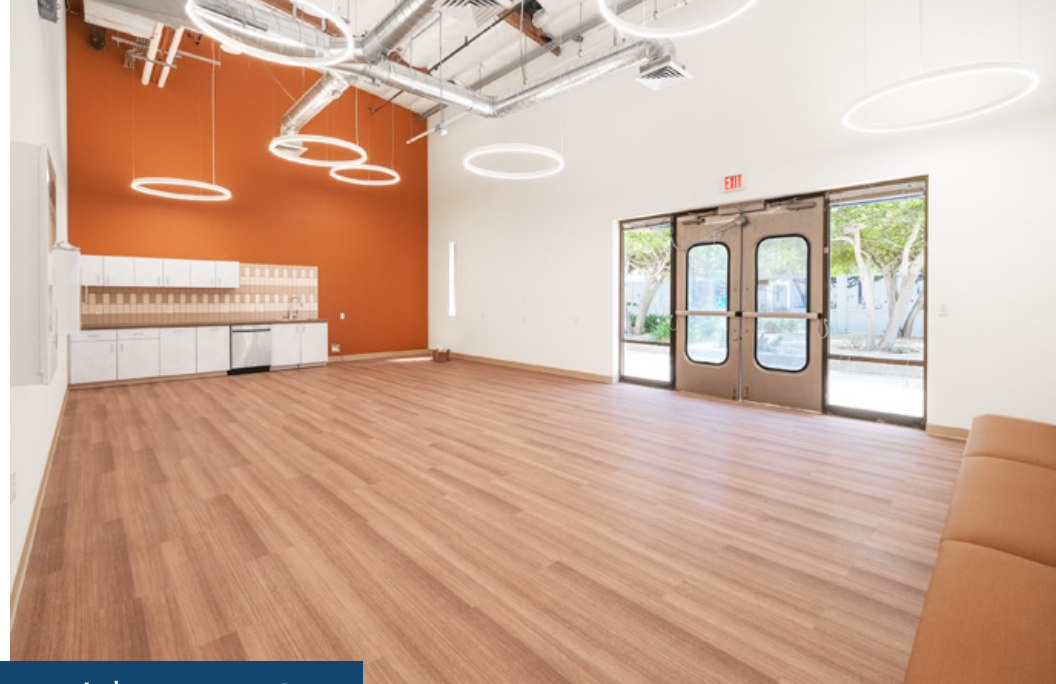
Building B | Industrial | 28,800 SF