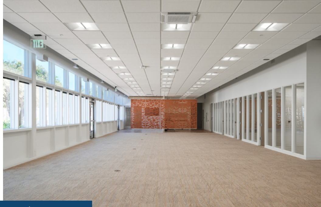
Building A | Office | 5,600 SF