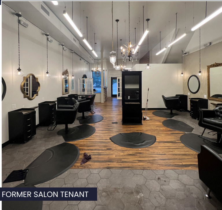
FORMER SALON TENANT