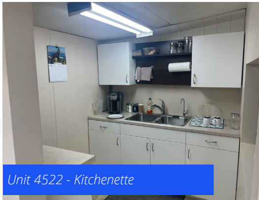
Unit 4522 - Kitchenette