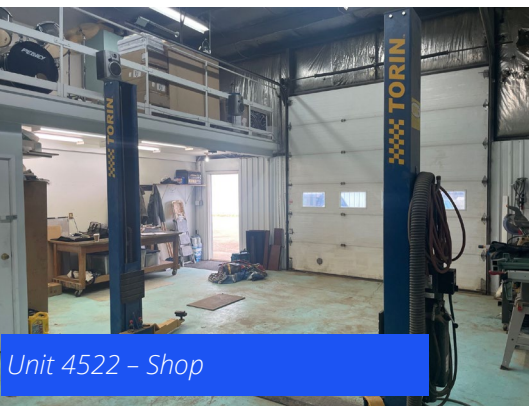
Unit 4522 - Shop