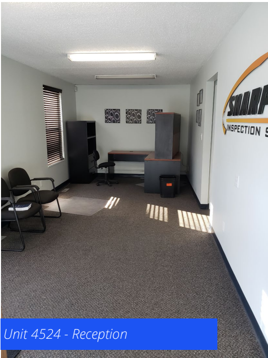
Unit 4524 - Reception