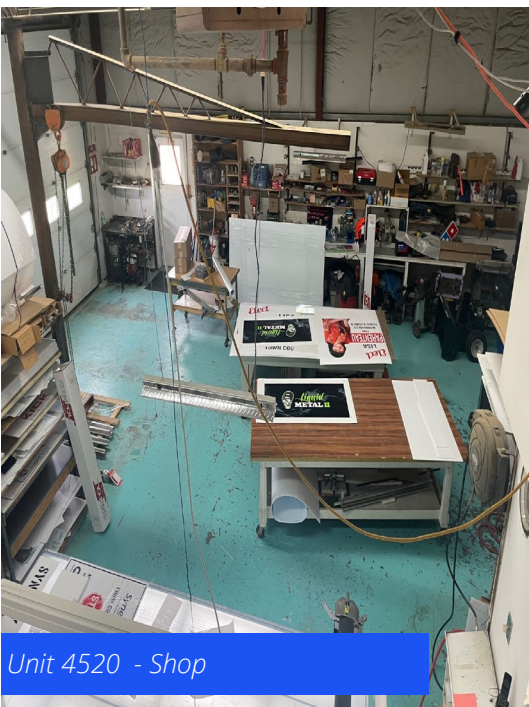
Unit 4520 - Shop