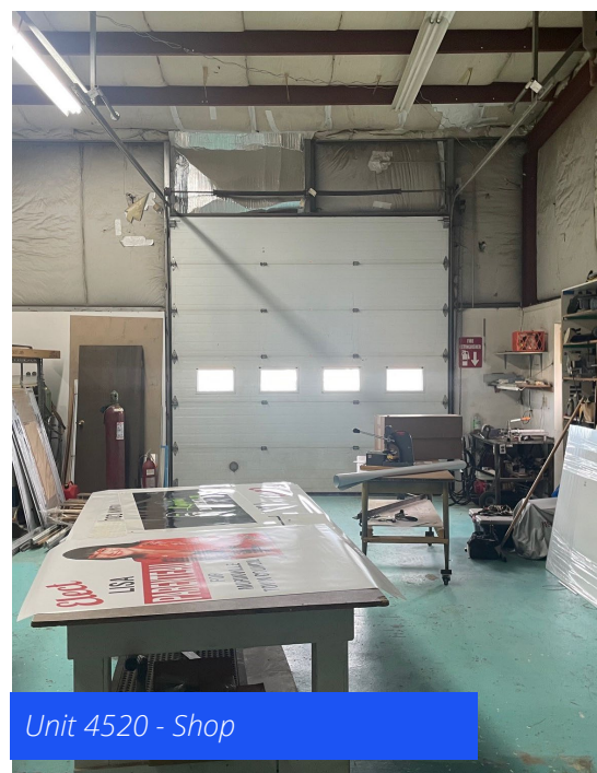
Unit 4520 - Shop