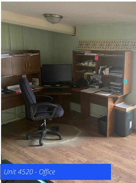
Unit 4520 - Office