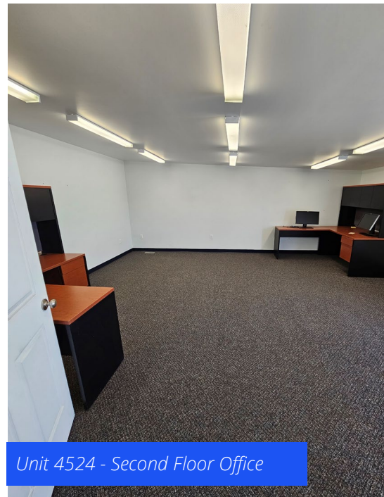
Unit 4524 - Second Floor Office