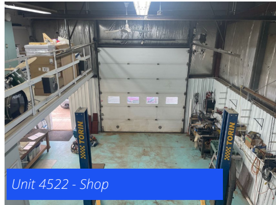
Unit 4522 - Shop