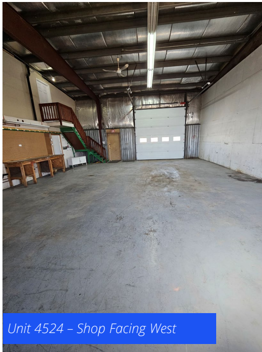
Unit 4524 - Shop Facing West