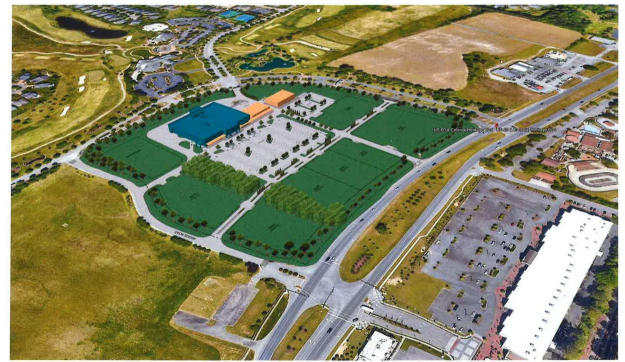
6801/6895 Richmond Road Williamsburg, VA