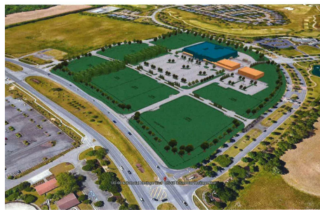
6895 Richmond Road Williamsburg, VA