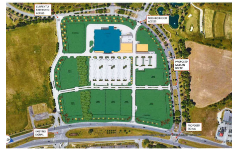
6895 Richmond Road Williamsburg, VA