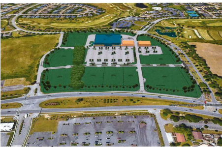
6895 Richmond Road Williamsburg, VA