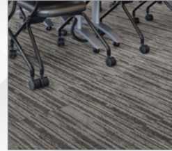
Mohawk Carpet Tile Blended Twist color Dusk Installation: Ashlar