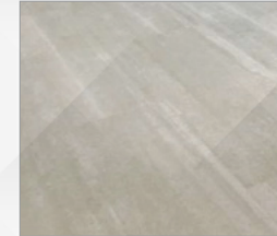
Mohawk LVT Living Local Chromascope Color 120 Alabaster