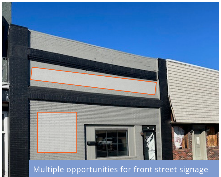
Multiple opportunities for front street signage