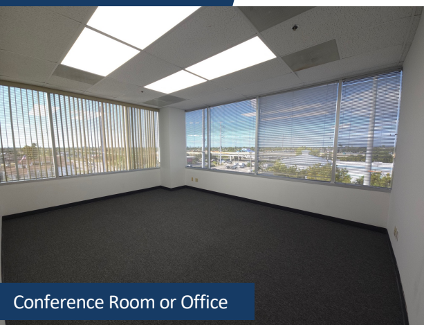
Conference Room or Office