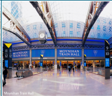
Moynihan Train Hall