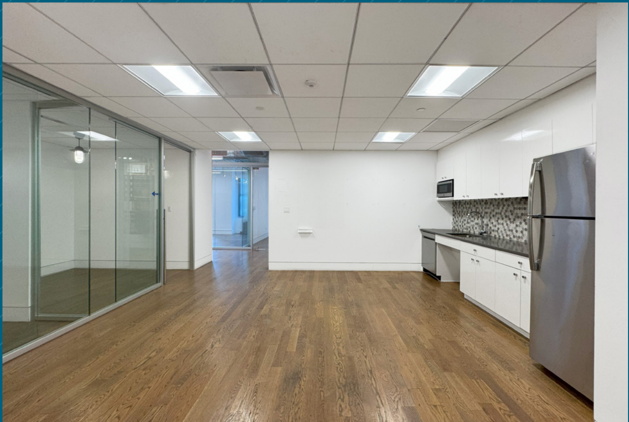
Wet Pantry with Seating Space and Two Glass-Front Break/Phone Rooms