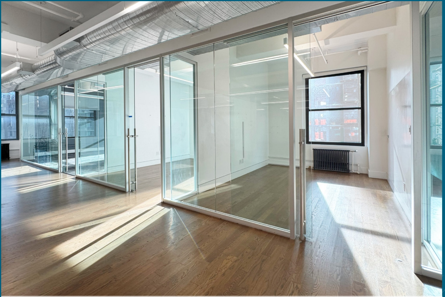
Glass-Front Private Workspaces