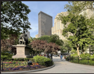
Madison Square Park