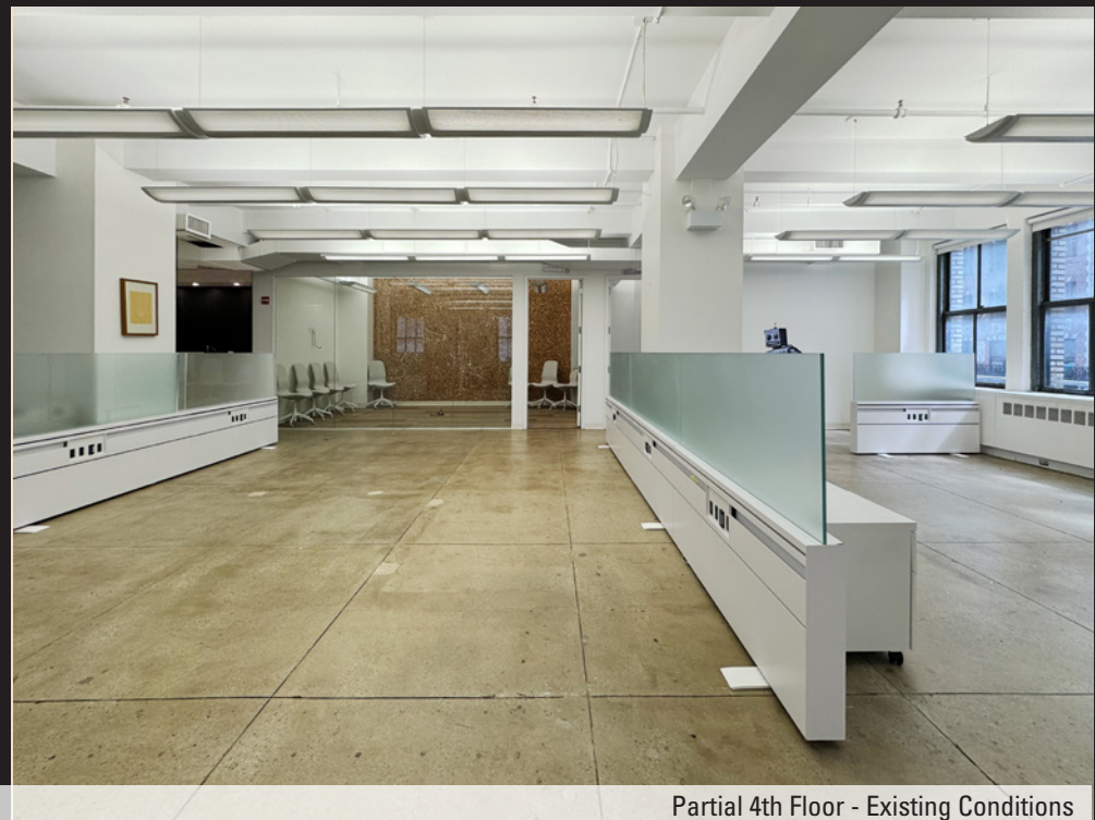
Partial 4th Floor - Existing Conditions

ABS Partners Real Estate, as the exclusive agent is pleased to offer the following opportunity for lease: