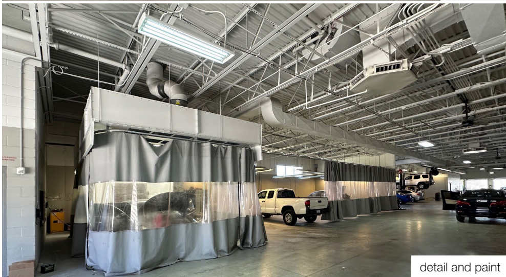
detail and paint