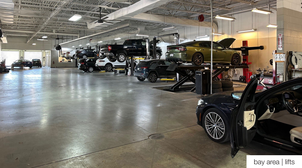
bay area | lifts