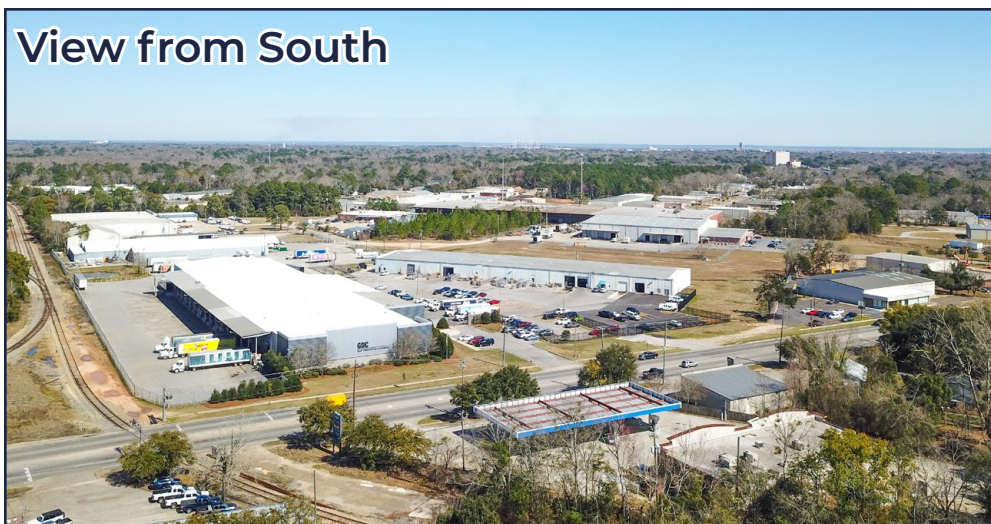
View from South