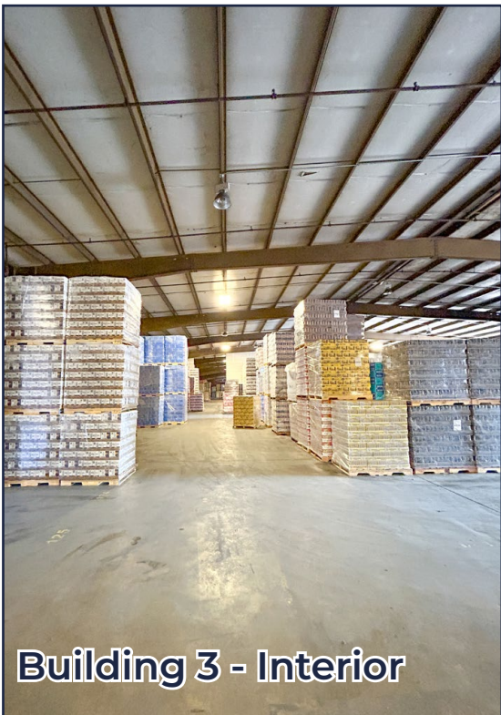
Building 3 - Interior