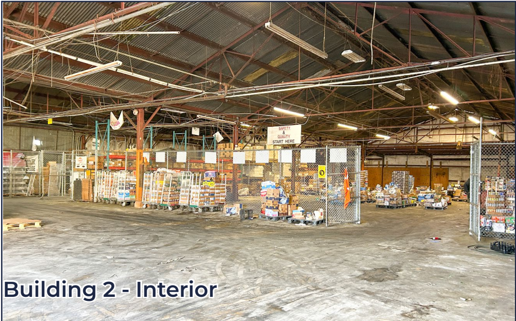
Building 2 - Interior