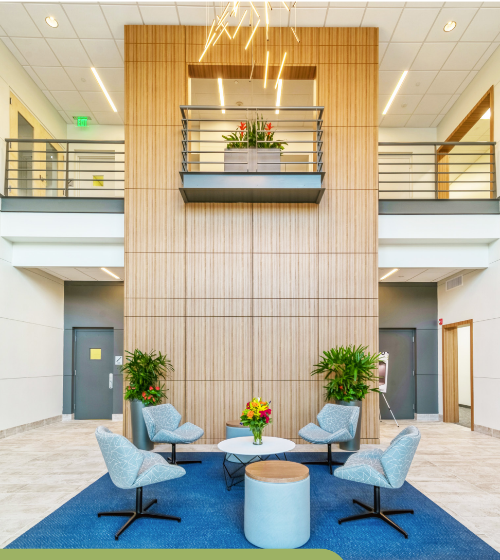
+/- 58,000 SF Office Building

702 Oberlin is located adjacent to Village District with abundant restaurant, shopping, and fitness amenities. Major capital improvements are in process including lobby, restrooms and the exterior façade with a completion date of December 2022. Conveniently located minutes from Downtown Raleigh, I-440, and Wade Avenue.