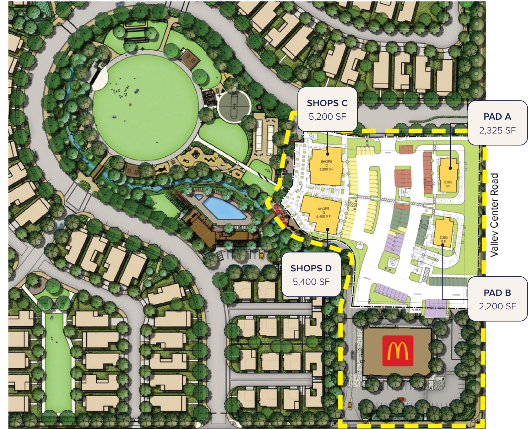
Mirar De Valle Road