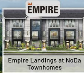
Empire Landings at NoDa Townhomes