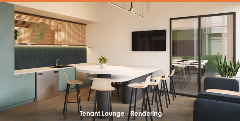
Tenant Lounge - Rendering