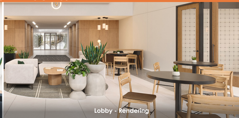
Lobby - Rendering