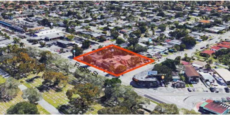
01 AERIAL (NW) VIEW