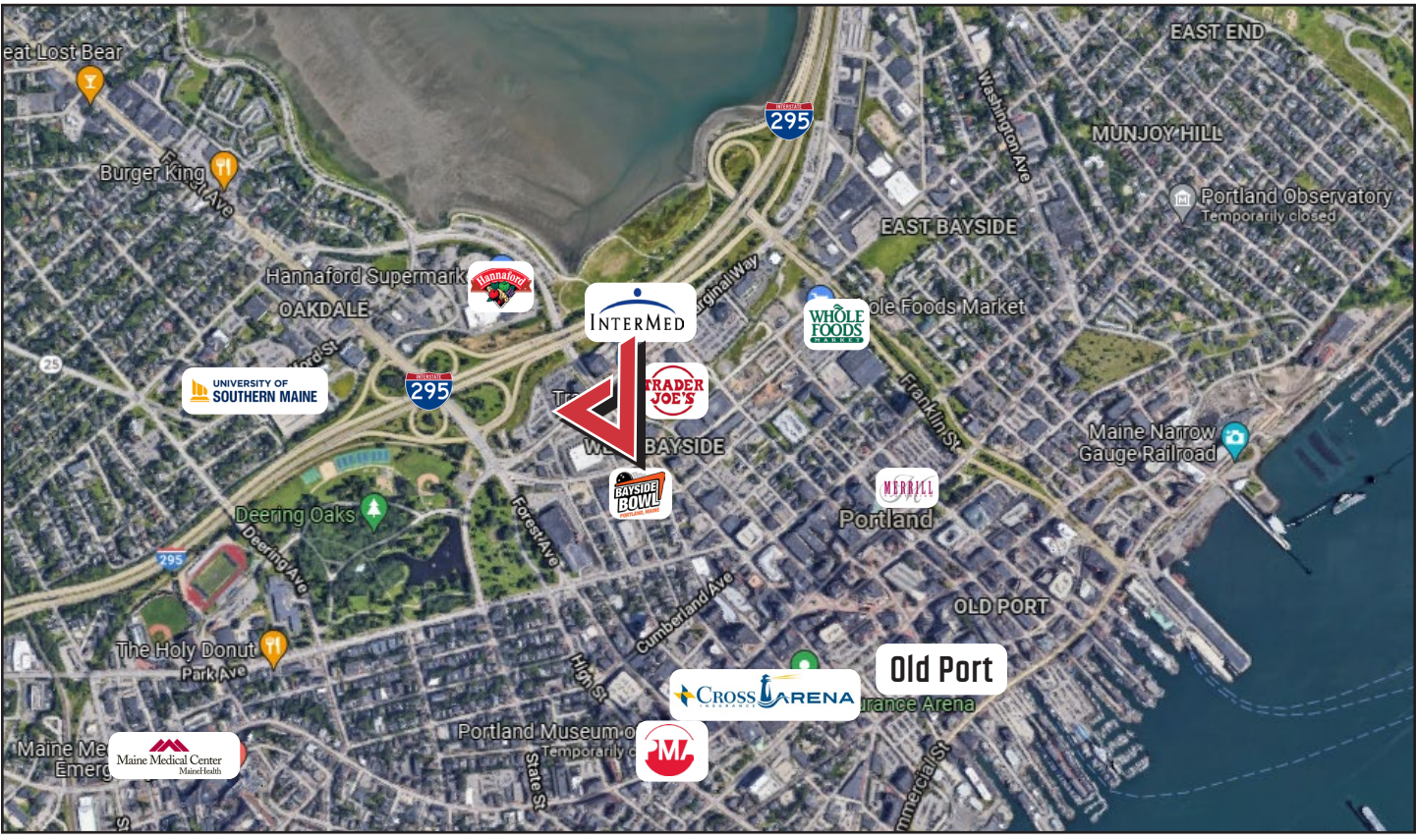
The information contained herein has been given to us by the owner of the property or other sources we deem reliable. We have no reason to doubt its accuracy, but we do not guarantee it. All information should be verified prior to purchase or lease.