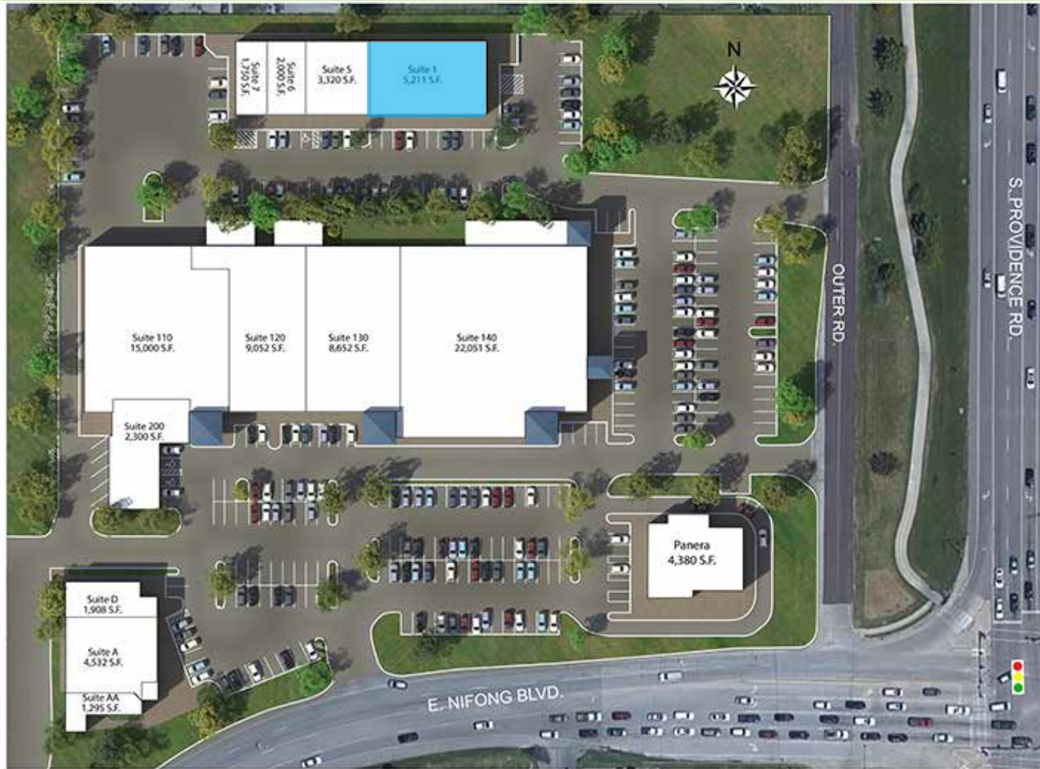
NIFONG SHOPPING CENTER COLUMBIA, MO