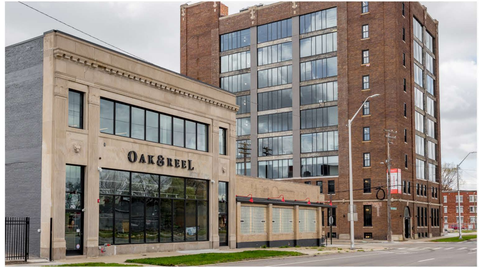
Located directly across East Grand Boulevard are Oak & Reel (Italian seafood), Chartreuse (new concept restaurant), and Chroma (office and co-working).