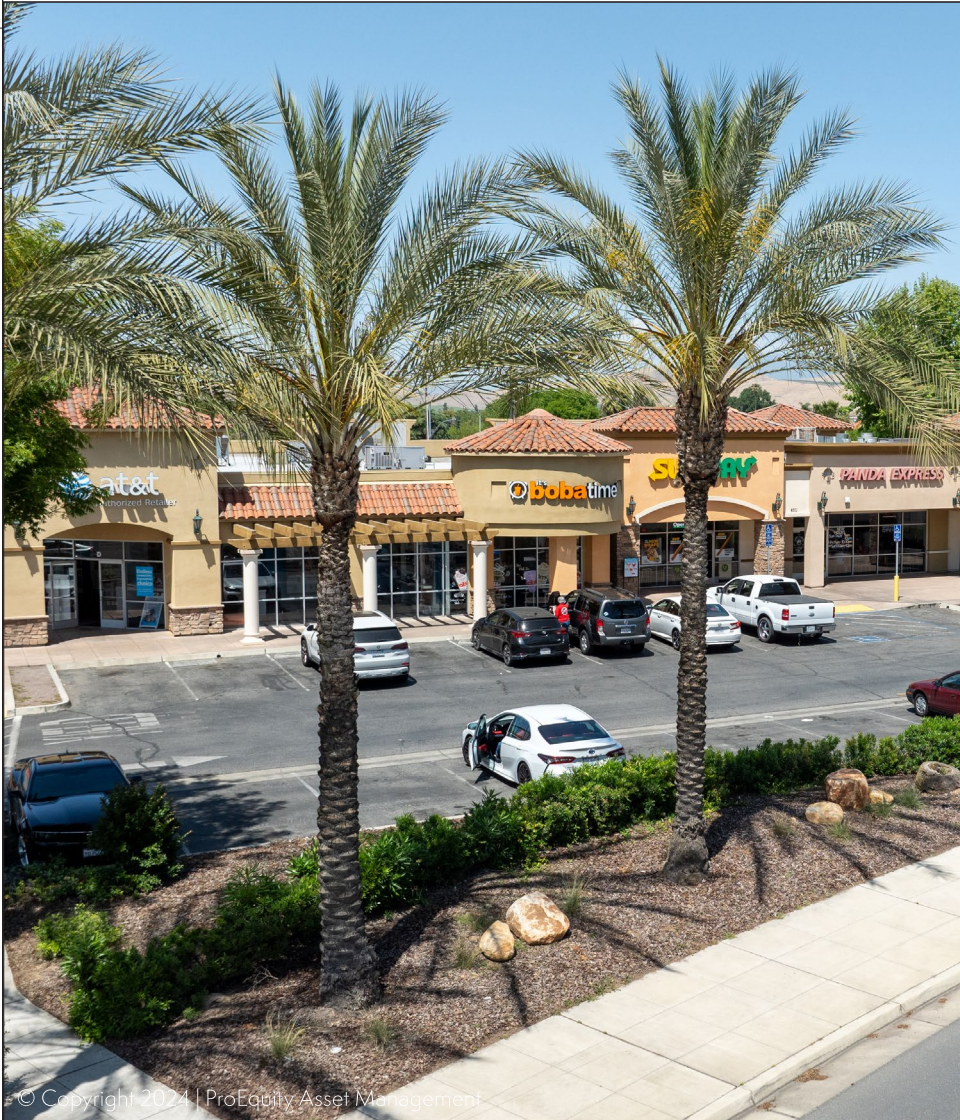
© Copyright 2024 | ProEquity Asset Management