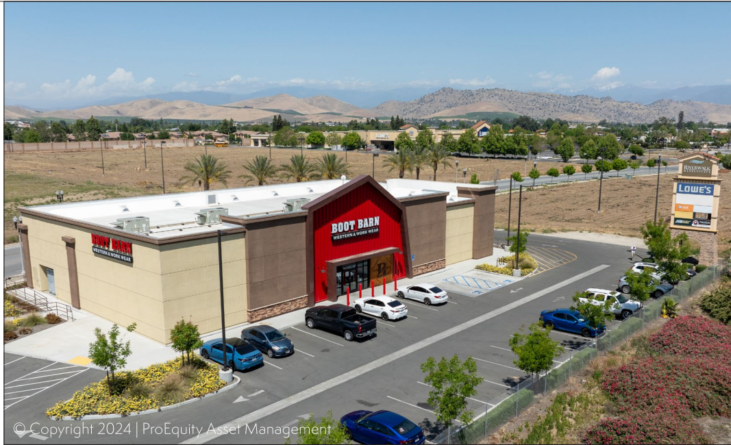
© Copyright 2024 | ProEquity Asset Management