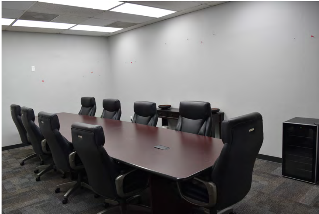
Plug and Play Furniture Included