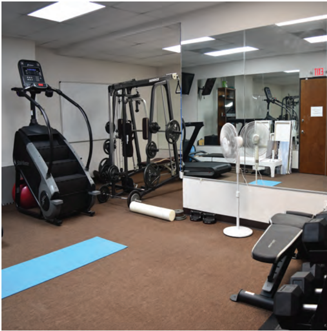
Optional Gym available